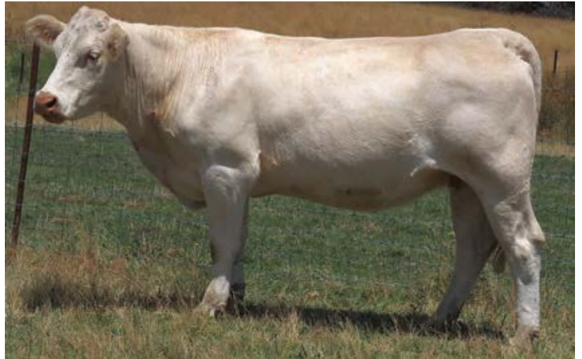
Rejoined to Waterford Red Rascal (PP) R/F from 20/10/24 Preg test details in supplementary sheet.

Her 2024 calf was born unassisted but unfortunately lost to scours a couple of weeks later.