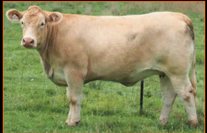
Maternal sister to Lot 15 and Donor Dam.