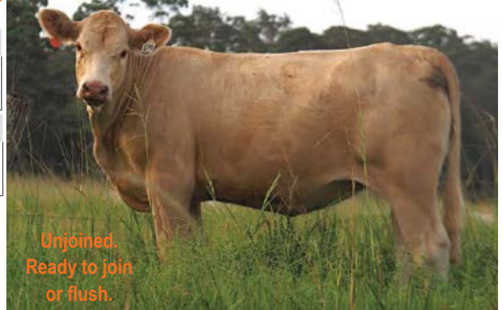
Unjoined. Ready to join or flush.

These next two lots are located at Nowra on south coast under different management and nutrition.