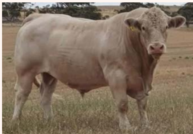
Minnie Vale Mascot