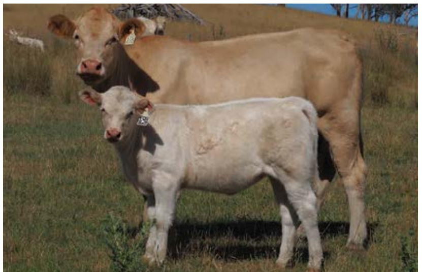
Rejoined to Glenlea Quintus (PP) from 20/10/24 Preg test details in supplementary sheet.

CALF: GLITZ 7TH (P) (GLE 24V107E) DOB: 09/09/2024 SIRE: RANGAN TAMBO R37 (RAN R37E) (P)