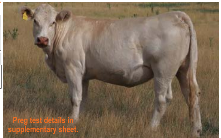
Preg test details in supplementary sheet.

Rejoined to Waterford Red Rascal (PP) R/F from 20/10/24.