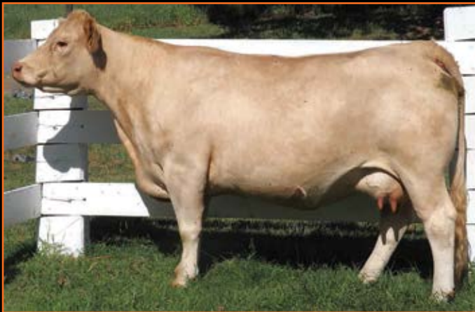
Maternal sister to Lot 3