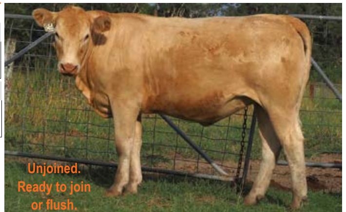
Unjoined. Ready to join or flush.