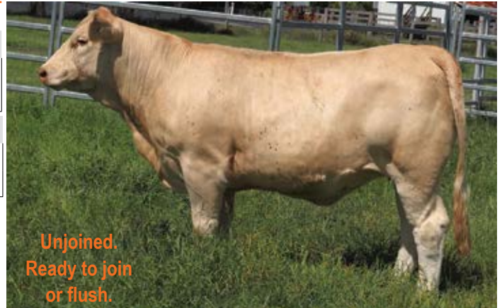
Unjoined. Ready to join or flush.