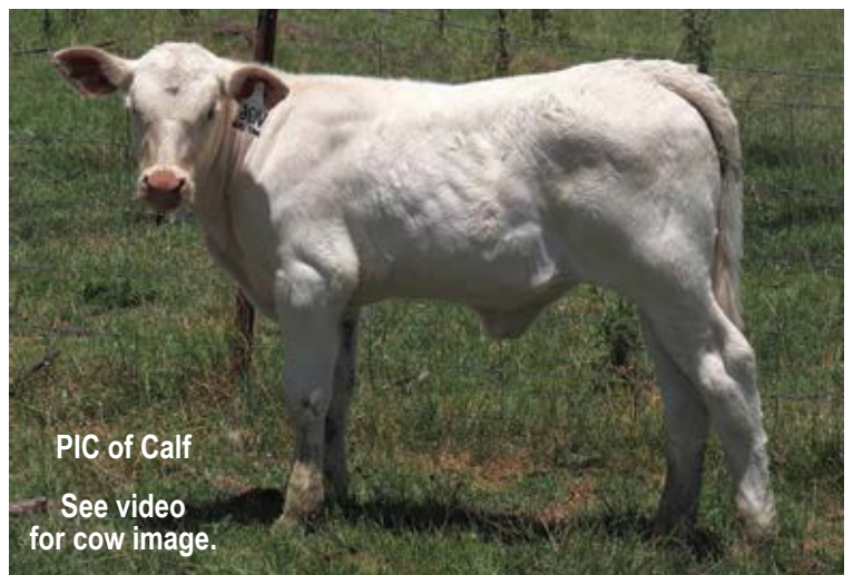
PIC of Calf

CALF: ROSLYN 7TH (P) (GLE 24V136E) DOB: 19/11/2024 SIRE: RANGAN TAMBO R37 (RAN R37E) (P)