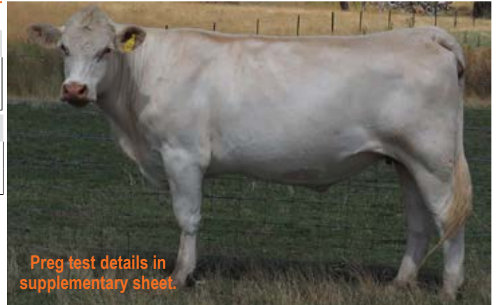
Preg test details in supplementary sheet.

Rejoined to Waterford Red Rascal (PP) R/F from 20/10/24.