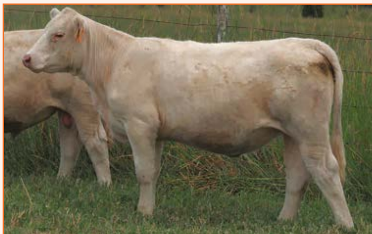
Lot 32 Weaned Calf GLE 24V812E