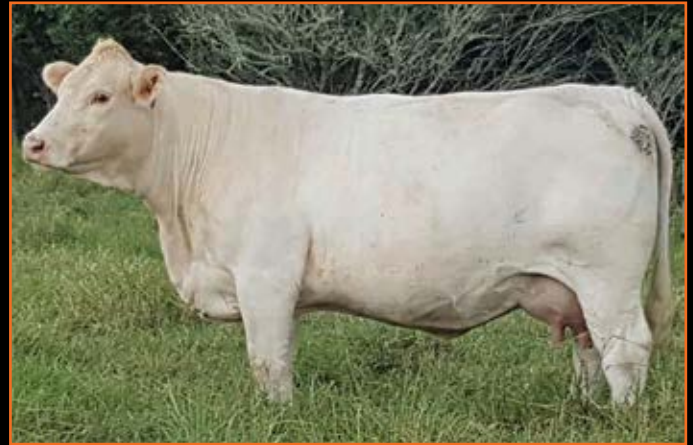
Dam of Lot 14 and Donor Dam.