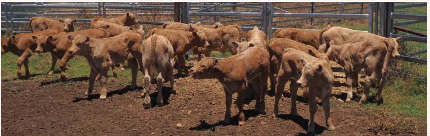
17 calves a few days old to 5 weeks born at time of photo. All sired by Glenlea Kowboy Red (P) R/F

This is an extraordinary opportunity to secure proven genetics, unparalleled longevity, and calves with the potential to drive your herd’s success for generations.