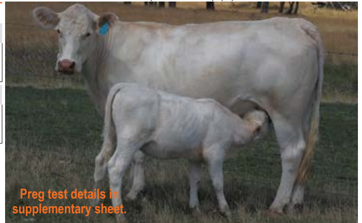
Preg test details in supplementary sheet.

COMMENTS: Early maturing young 1st calver, good carcass and data, easy doing type. Dam is high was purchased from our 2021 sale as a joined 2 yo heifer. CAF is a neat early maturing heifer.