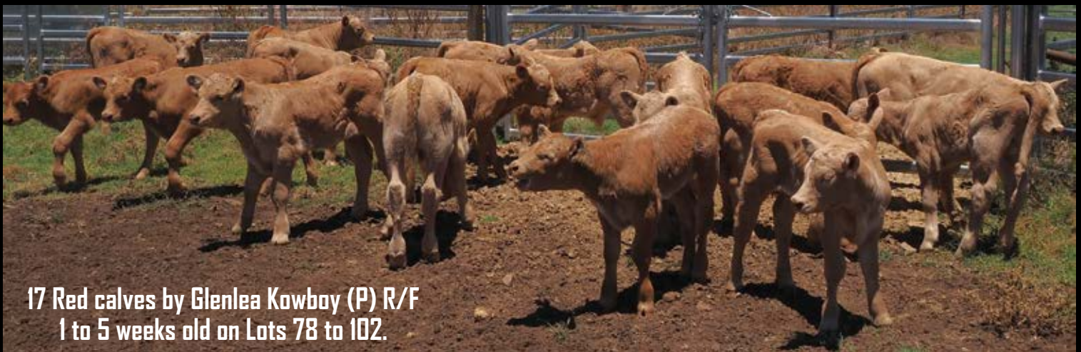
17 Red calves by Glenlea Cowboy (P) R/F 1 to 5 weeks old on Lots 78 to 102.