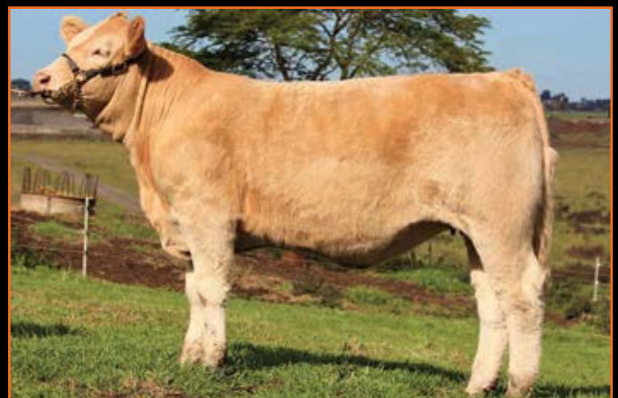
Maternal sister to Lot 72 At 11 months sold for $8,000, private sale.