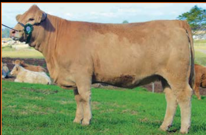
Dam of Lot 6. Reserve champion Heifer at Beef 2021, top priced charolais female sold at auction in 2021 for $26,500 and now Donor Dam.