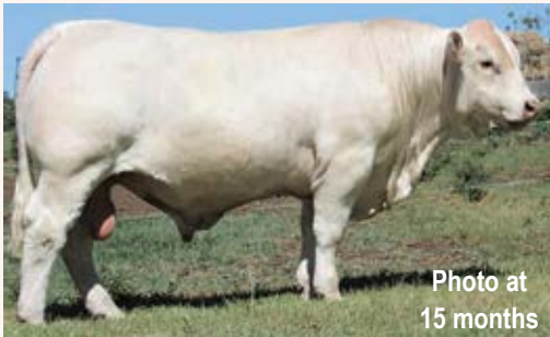
Photo at 15 months