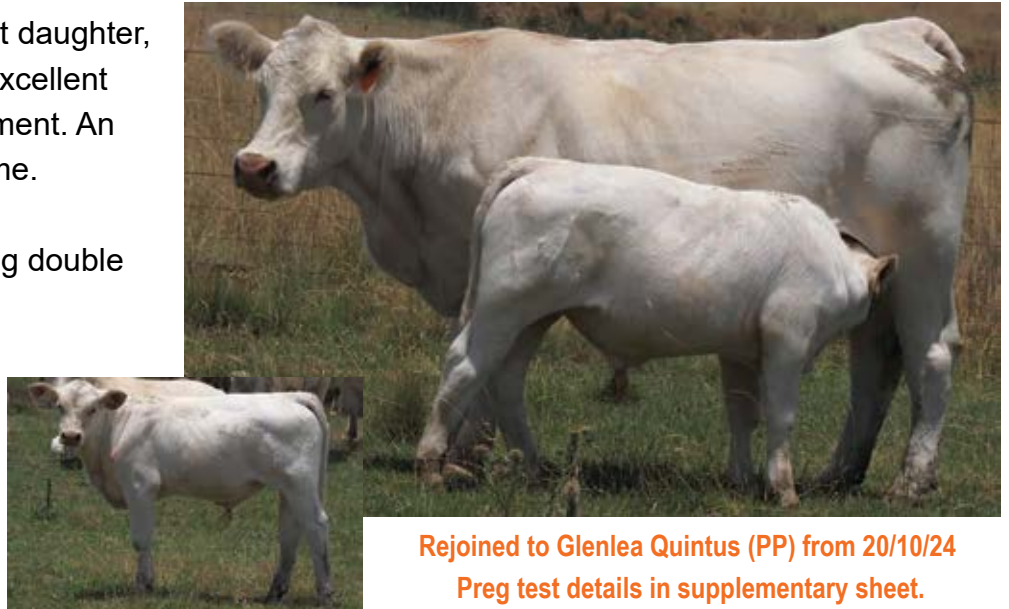
Rejoined to Glenlea Quintus (PP) from 20/10/24 Preg test details in supplementary sheet.

CALF: TAMBO V102 (P) (GLE 24V102E) DOB: 20/08/2024 SIRE: RANGAN TAMBO R37 (RAN R37E) (P)