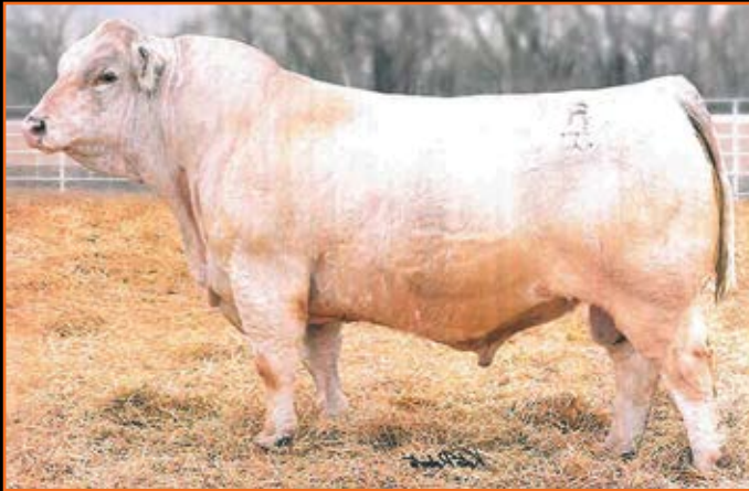
RBM Fargo (PP) USA imported sire, low BW, with above breed average growth and top 1% of breed Fat cover. Sire of lots 5, 6 and 7.