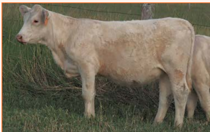
Lot 33 Weaned Calf GLE V36E