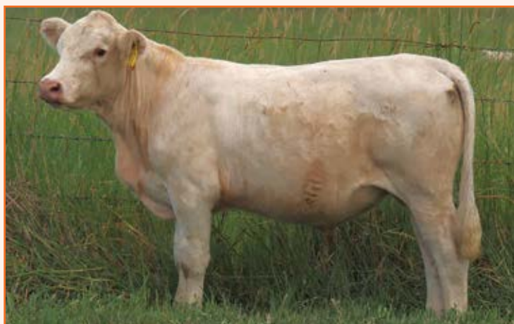
Lot 53 Weaned Calf GLE 24V807E