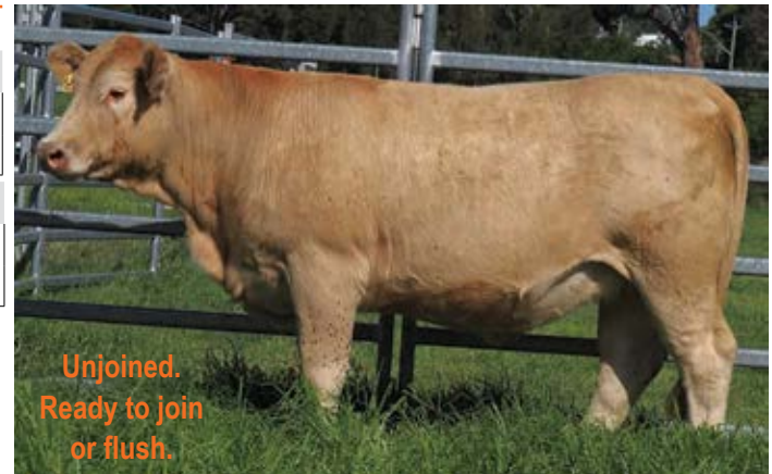
Unjoined. Ready to join or flush.