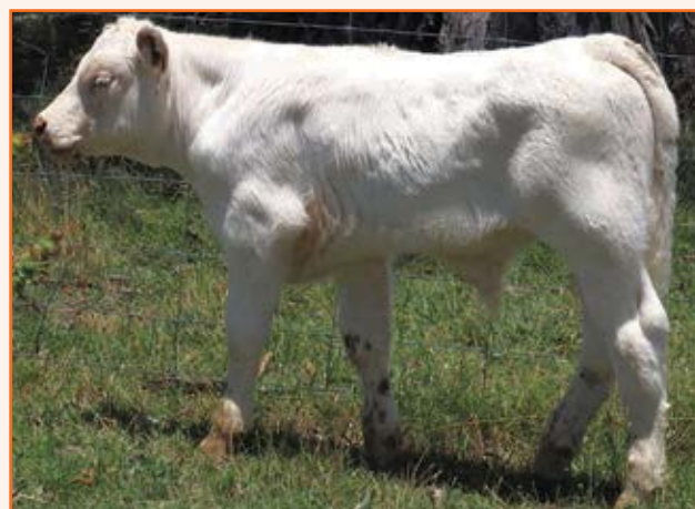
Lot 36 Calf at Foot GLE 24V145E