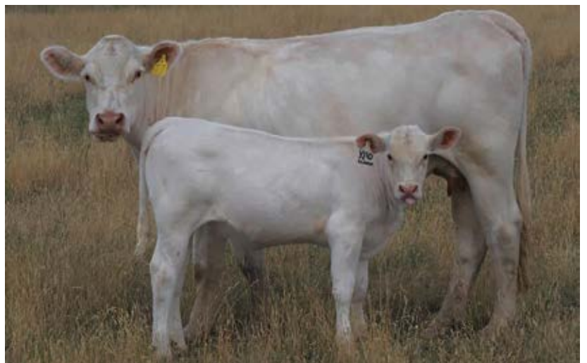
Rejoined to Waterford Red Rascal (PP) R/F from 20/10/24 Preg test details in supplementary sheet.

CAF polled heifer is as neat as they come, super soft, with eye appeal and excellent data.