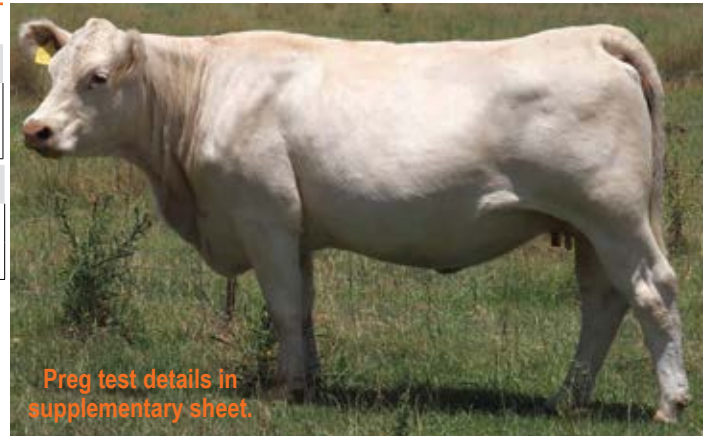
Preg test details in supplementary sheet.

Rejoined to Glenlea Quintus (PP) R/F from 20/10/24.