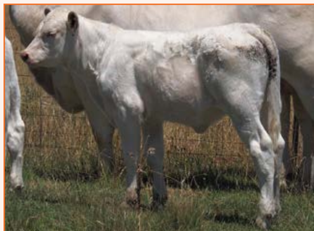
Lot 34 Calf at Foot GLE 24V135E