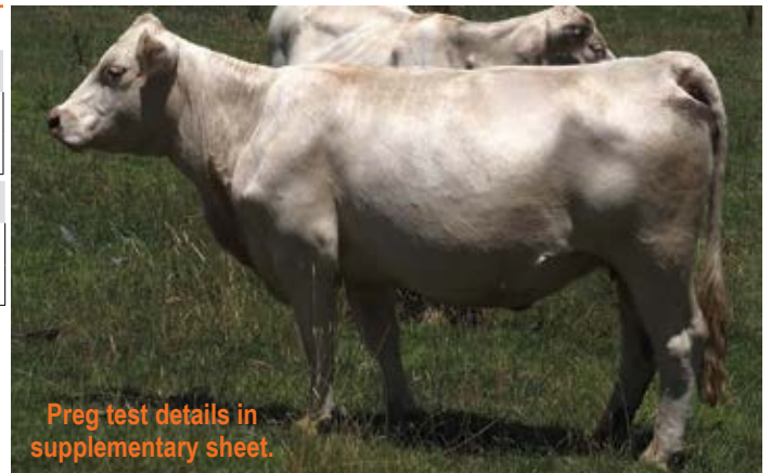
Preg test details in supplementary sheet.

Rejoined to Glenlea Quintus (PP) R/F from 20/10/24.