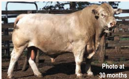
Photo at 30 months