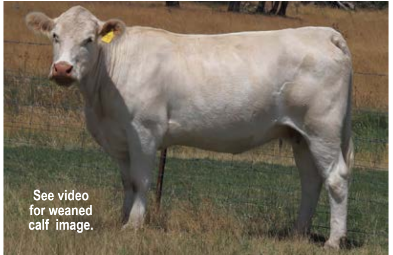
See video for weaned calf image.

COMMENTS: Very well made, good bodied daughter of M.V. Jona. Very gentle nature, an easy doing female, low BW and strong carcass data, the cross with "Red Rascal" will be a great one.