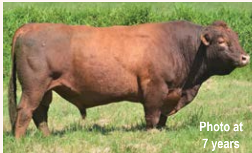
Photo at 7 years