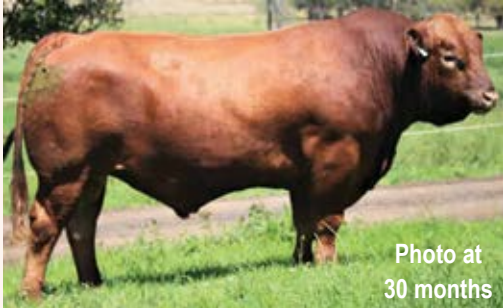
Photo at 30 months