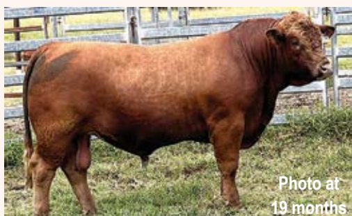
Photo at 19 months

VALLEY VIEW C004 ESTELLA 145 (VLW C4E) (P)