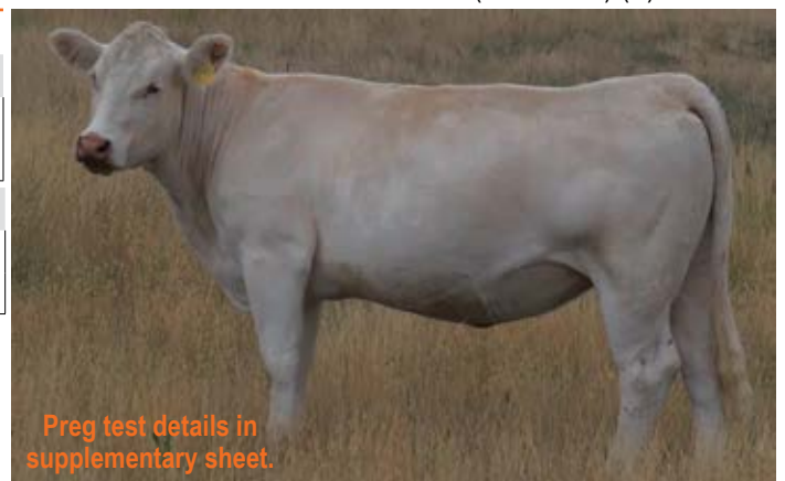
Preg test details in supplementary sheet.

Rejoined to Waterford Red Rascal (PP) R/F from 20/10/24.