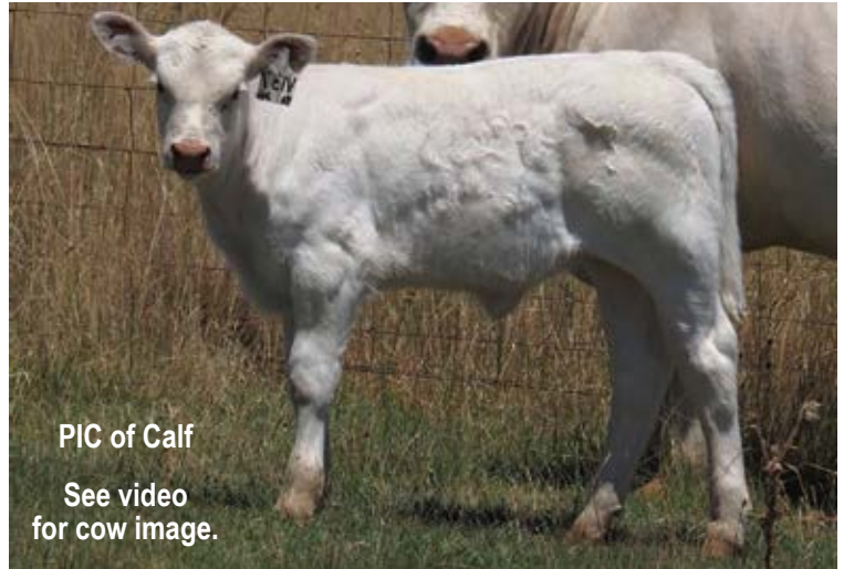
PIC of Calf