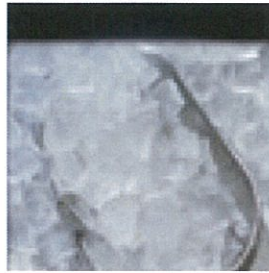
Ice system filtration.