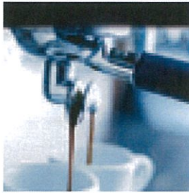
Hot beverage filtration.