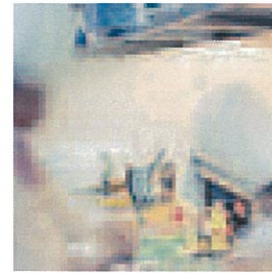
Steam treatment filtration.