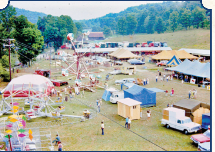
A LOOK AT THE THE CORNISH FAIR FROM AUGUST 20, 1971

Beyond the educational aspect, the Cornish Fair has woven itself into the fabric of countless lives, building community bonds and creating lasting memories. It's a place where neighbors reconnect, where traditions are passed down, and where the spirit of rural life is celebrated with enthusiasm. As we look back on 75 years, we are incredibly proud of the fair's enduring legacy in promoting agricultural literacy and fostering a strong sense of community. Here's to many more years of "Little Fair, Big Fun" and continuing to cultivate a love for agriculture in all who visit!