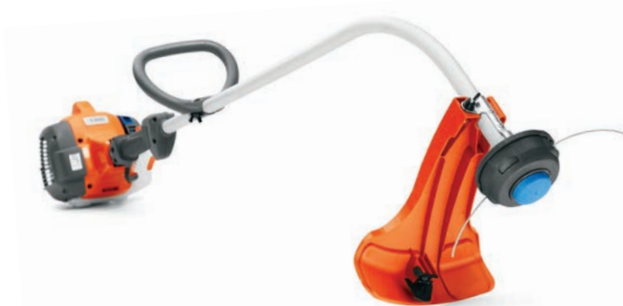
Part No. 970514305