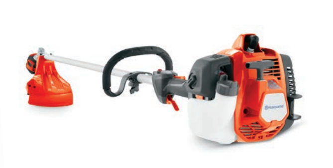
Part No. 970514405