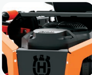
Premium Kohler engines