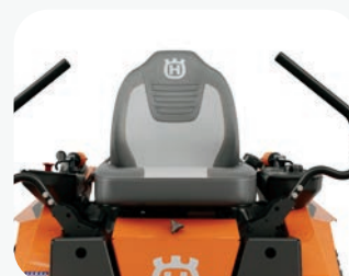
High-back 18" seats