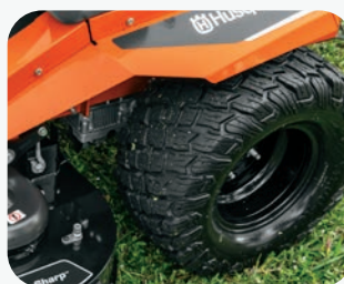
Rugged all-terrain tires