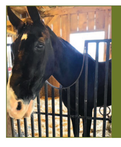
River, a 19-year-old Tennessee Walker gelding, is living out his golden years at Freedom Hill.

experience!" she said. "I owned horses when I was younger, and my involvement with Freedom Hill really rekindled my love for them." Proceeds from the event will be used to meet the needs of the formerly neglected, abused and unwanted horses now in the rescue's care.