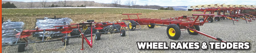
WHEEL RAKES & TEDDERS

RAKE & TEDDER PARTS FOR MANY BRANDS INCLUDING KRONE