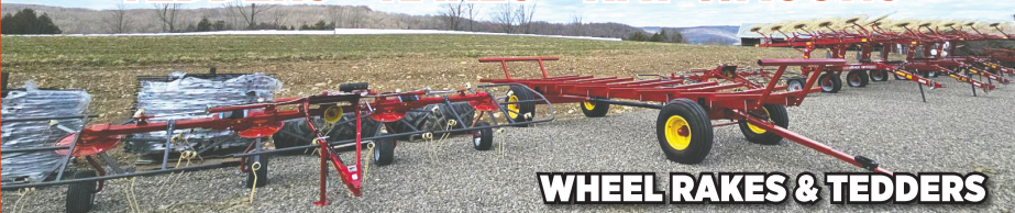
WHEEL RAKES & TEDDERS

RAKE & TEDDER PARTS FOR MANY BRANDS INCLUDING KRONE