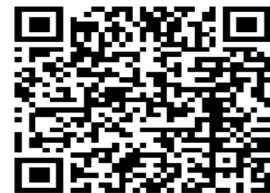
SCAN FOR CONFIRMATION