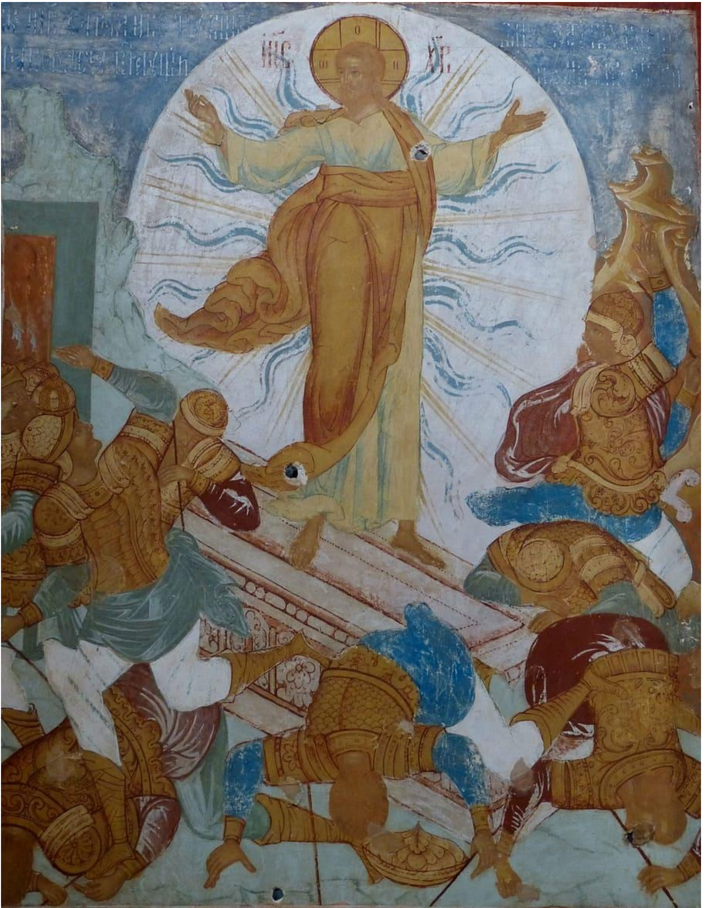
Russian Icon, Unknown Title