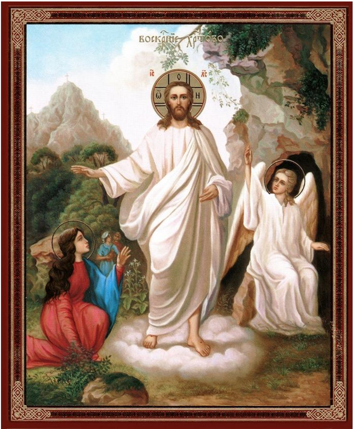
Christ at the Tomb, Orthodox Icon