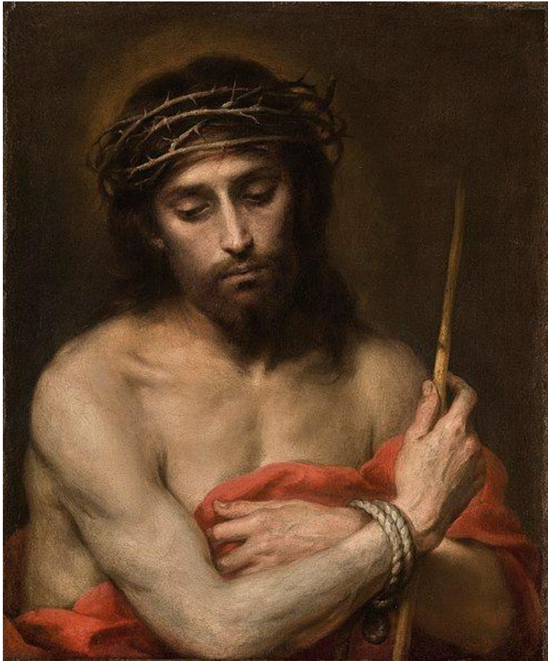
Ecce Homo (Behold the Man), by Murillo (1617-1682)