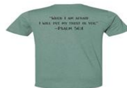
St. Rose of Lima Bismarck: Screen Print Style: 3001CVC - Heather Dusty Blue