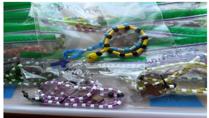
Rosaries Vacation Bible School kids made.