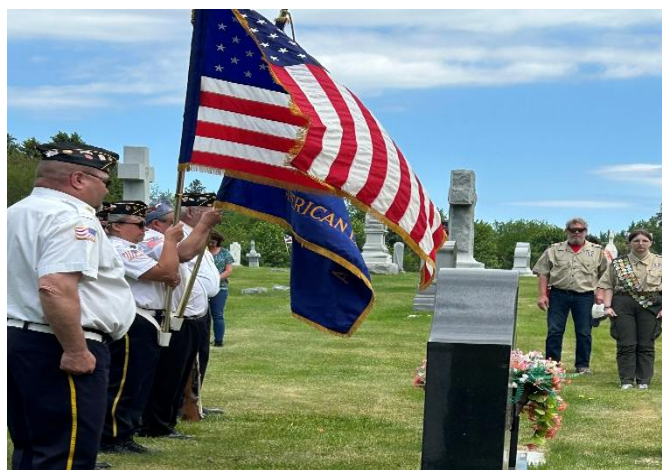
American Legion, Boy Scouts, Mass 2026 Trumpet playing honoring our Military.