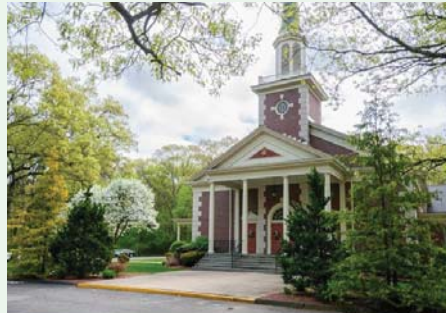
ST. ANN CHURCH, 134 COCHITUATE RD, WAYLAND, MA

Parish Office Hours: Monday—Thursday 9 AM—3 PM Friday 9 AM—12 PM