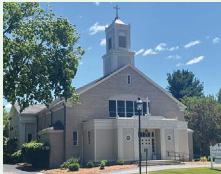
ST. ZEPHERIN CHURCH, 99 MAIN ST, WAYLAND, MA