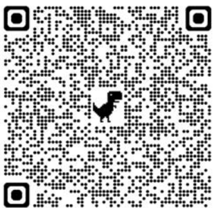
Dirty Laundry QR code