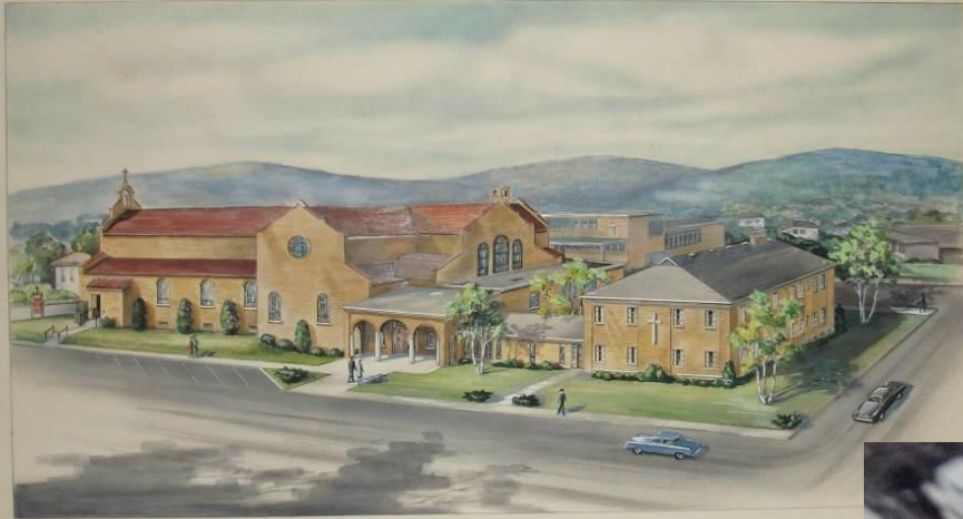
OUR LADY of GOOD COUNSEL CHURCH ADDITION and RECTORY ENDICOTT, NEW YORK