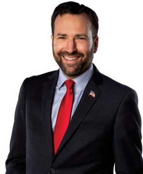
BEN ALLEN Senator, 24 th District