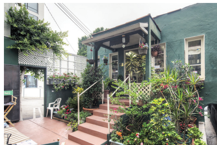
MYSTERY PIER BOOKS, INC. Collectible Literature in the First Edition

Mystery Pier Books, called "one of — if not the — most important first edition bookshops in the U.S." — remains a major tourist attraction in WeHo for over 25 years. Featured in airline magazines of Delta, Alaska & United, Louis Vuitton catalogue, Best of the Best edition of Los Angeles magazine & so many others, raved about on late night talk shows by its many celebrity clients. Michael Caine says, "Mystery Pier is like the most wonderful museum, except you get to buy the exhibits." Angelina Jolie says "More than a museum & place of treasure than a shop. A dream!"