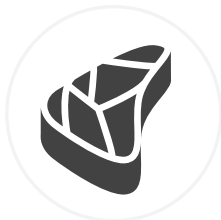
8oz. AAA NEW YORK STEAK