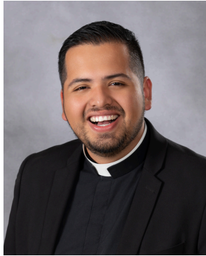
Home Parish: St. Mary, West Chicago First Assignment: Parochial Vicar at St. Isidore, Bloomingdale

We congratulate and pray for the following men of the Joliet Diocese, who will be ordained to the priesthood on June 6 th .