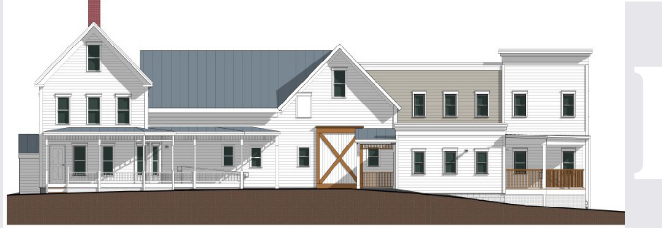
Bradford clinic post-renovation