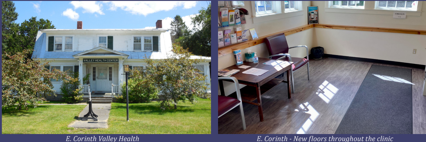
E. Corinth Valley Health

Town Appropriations: Bradford, Corinth, Fairlee, Groton, Ryegate, Topsham