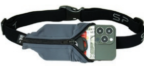
Color: Anthracite with Black Zipper ALG-7BL-029-001 814194017047