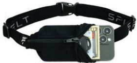
Color: Black ALG-7BL-001-001 814194012264

9" X 4" X 2" POCKET HOLDS LARGER SMARTPHONES AND MORE!