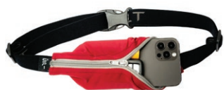
Color: Bonfire with Titanium Zipper ALG-7BL-098-029 814194016972