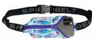
Color: Fancy Fish with Purple Zipper ALG-7BL-015-012 814194017245