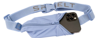
Color: Periwinkle ALG-3BL-502-502 814194017450

This fitness belt is called one of the best running belts for marathon runners, but its use doesn't stop there. It is perfect for walking, working out, travel, medical needs, and so much more.