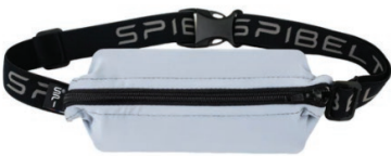
Color: Seafoam /Black Band ALG-ECO-089-001 814194016712

The Eco SPIbelt features the same capacity and fit as The SPIbelt, but is made with 87% recycled materials! Production of the Eco SPIbelt re-directs plastic water bottles, plastic scraps, fabric, and elastic that would otherwise go to landfills. Here at SPIbelt, we're on a mission to help people live their best active lives, and we believe that a healthy planet supports healthy communities.