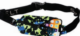
Color: Paintball with Black Zipper ALG-7BL-146-001 814194017139