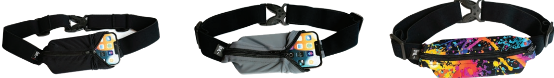
Color: Black ALP-7BL-001-001 814194017191