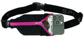
Color: Black with Hot Pink Zipper ALG-7BL-001-007 814194012356