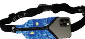
Color: Starry Night with Black Zipper ALG-7BL-148-001 814194017153