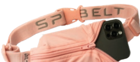
Color: Rose Gold ALG-2BL-501-501 814194017382