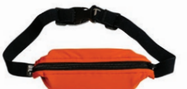
Color: Burnt Orange with Black Zipper ALG-7BL-010-001 814194017351