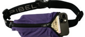
Color: Eggplant with Black Zipper ALG-7BL-115-001 814194015685