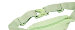
Color: Matcha ALG-PRO-500-500 814194017399