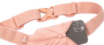
Color: Rose Gold ALG-PRO-501-501 814194017405