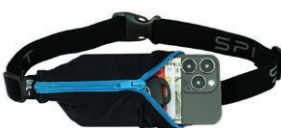
Color: Black with Turquoise Zipper ALG-7BL-001-008 814194012363