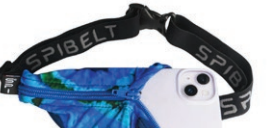
Color: Cool Groove ALG-7BL-144-002 814194016903