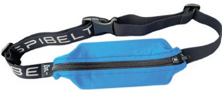
Color: Caribbean Blue with Black Zipper ALG-ECO-146-001 814194017115