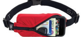
Color: Red with Black Zipper ALG-7BL-003-001 81419401230