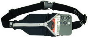
Color: Black with Titanium Zipper ALG-7BL-001-029 814194013780