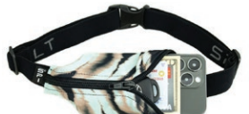
Color: Mint Marble with Black Zipper ALG-7BL-135-001 814194016323