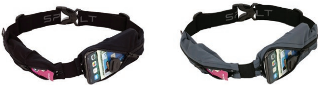
Color: Black with Black Zipper DUP-7BL-001-001 814194015029