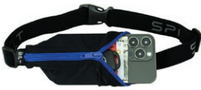
Color: Black with Blue Zipper ALG-7BL-001-002 814194012271