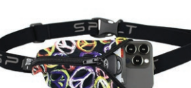
Color: Whirled Peace with Black Zipper ALG-7BL-028-001 814194016736