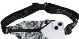
Color: Raven ALG-7BL-143-001 814194016897