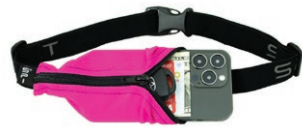
Color: Fuchsia with Black Zipper ALG-7BL-110-001 814194015586