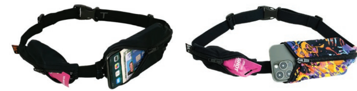
Color: Black with Black Zipper DUA-7BL-001-001 814194012257

Dual Pocket SPIbelt – featuring two separate expandable pockets. The bigger pocket can expand to hold larger smartphones. The smaller pocket expands to hold keys, money, ID, even an inhaler.