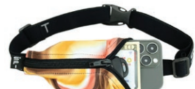
Color: Neapolitan with Black Zipper ALG-7BL-136-001 814194016330