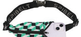
Color: Blox ALG-7BL-145-001 814194016927