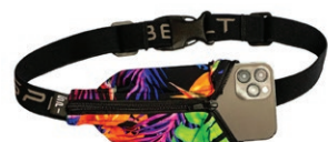
Color: Paradise with Black Zipper ALG-7BL-123-001 814194017269