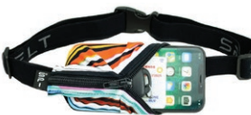
Color: Kickflip with Black Zipper ALG-7BL-125-001 814194016217