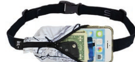
Color: Glacier with Black Zipper ALG-7BL-100-001 814194015258