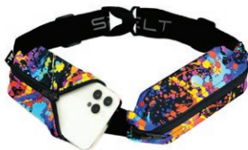
Color: Rave with Black Zipper DUP-7BL-023-001 814194015043