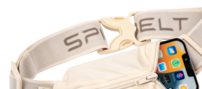
Color: Toasted Sesame ALP-PRO-503-503 814194017481