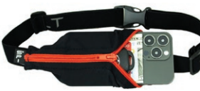
Color: Black with Red Zipper ALG-7BL-001-003 814194012288