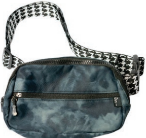
Color: Cobalt XBD-301-001 814194016958