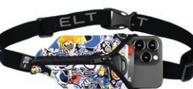
Color: Graffiti Skulls with Black Zipper ALG-7BL-018-001 814194016750