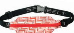
Color: Flux ALG-7BL-147-097 814194017146