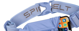
Color: Periwinkle ALP-PRO-502-502 814194017474