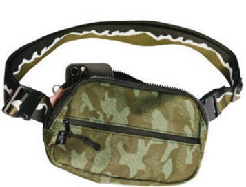
Color: Peaks XBD-300-001 814194016941

Introducing the all-new Crossbody Bag. The new SPIbelt accessory features a luxurious pouch material with a fashion forward and adjustable strap design that provides all the space needed to confidently conquer an everyday lifestyle.