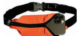
Color: Coral with Black Zipper ALG-7BL-087-001 814194017252