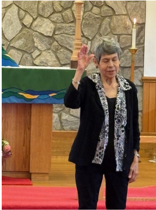
She sang a hymn for those of us in the service last Sunday.