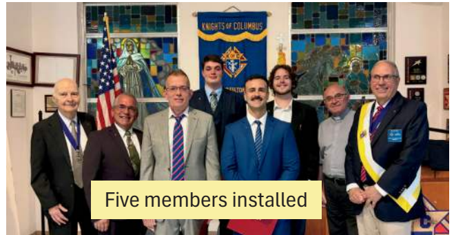
Five members installed