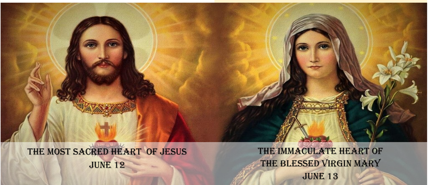
THE MOST SACRED HEART OF JESUS JUNE 12

La Eucaristía también nos une unos a otros. Compartimos esta comida con otros cristianos como signo de nuestra fe común. Cristo, que se entregó al Padre en la cruz, se entrega también a nosotros en la Eucaristía. Y debido a que la comida que compartimos es el Cuerpo y la Sangre de Cristo, en cierto sentido nos convertimos en lo que comemos. Así que todos somos miembros del Cuerpo de Cristo. Demostramos esto a través del amor, al compartir la fe, al perdonarnos unos a otros y con nuestro servicio mutuo. Si creemos que Jesús es divino, debemos creer en su palabra de que la Eucaristía es verdaderamente su Cuerpo y Sangre, entregado por nosotros.