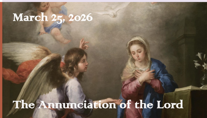
March 25, 2026