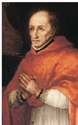
St. Turibius of Mogrovejo

Christ said “I am the Truth.” He did not say “I am the custom”