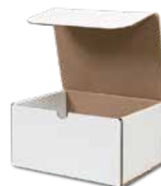
Temporary Cardboard Urn (included)

*** None of our packaged plans include the charges of other parties that may be involved such cemetery fees, church, clergy, musician, and vocalist honorariums, paid obituary charges of the newspaper, certified copies of the death certificate, and state sales tax, unless specified. ***