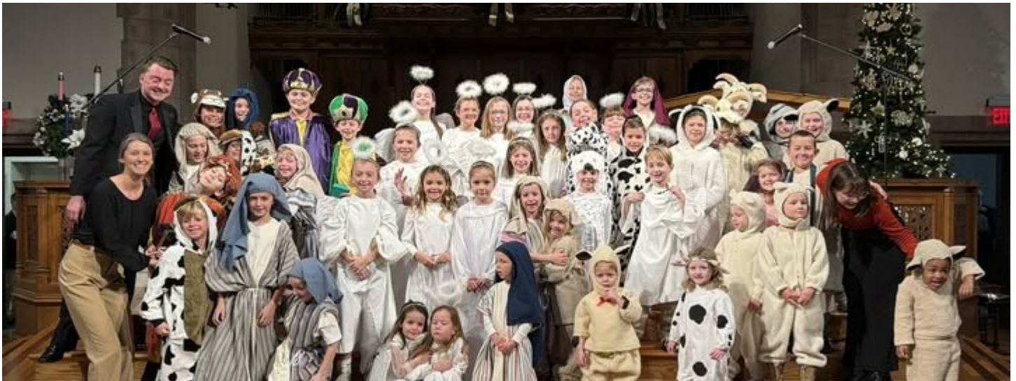
Children's Christmas Pageant. We had over 50+ children participate!

Here's to a wonderful 2025 holiday season. May peace, love, and prosperity follow you into the New Year!