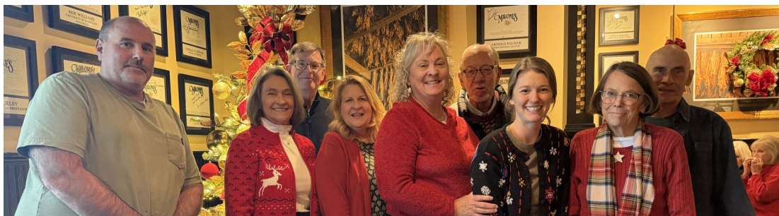
The staff enjoyed a holiday lunch at Malones.