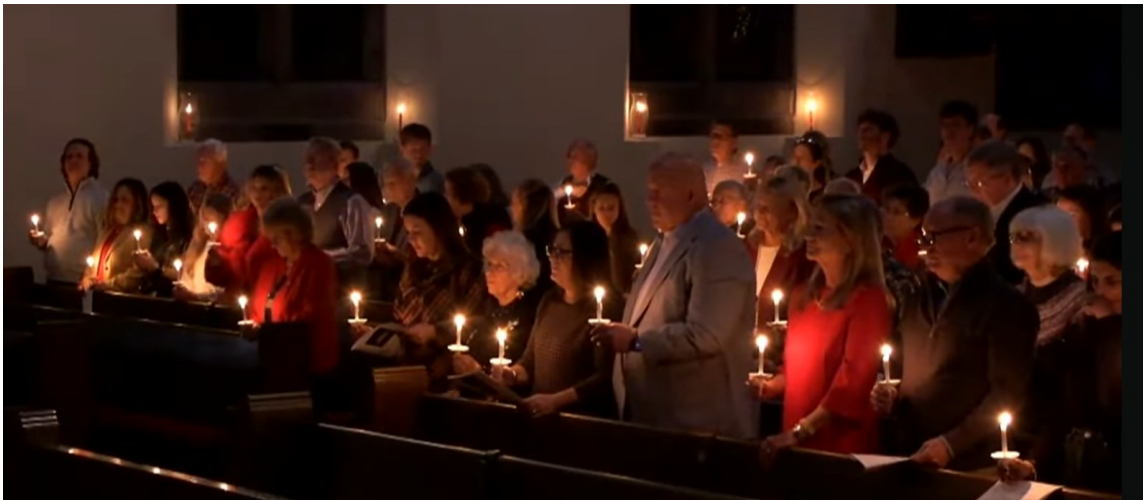
Candlelight Christmas Eve Service