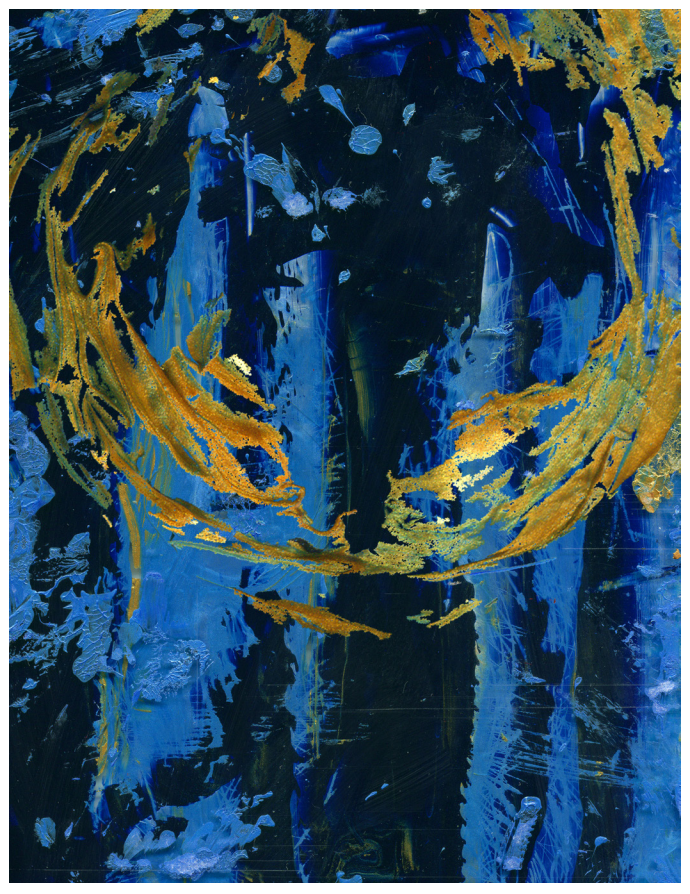
Kinfolk

10:00 am – Sanctuary Sixteenth Sunday in Ordinary Time