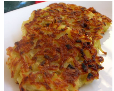
Home Made Latkes