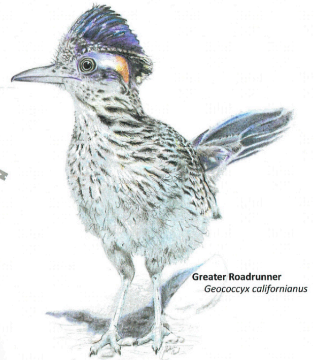
Greater Roadrunner Geococcyx californianus