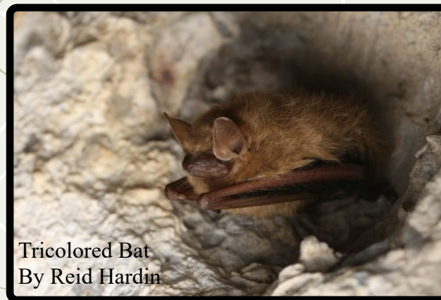
Tricolored Bat