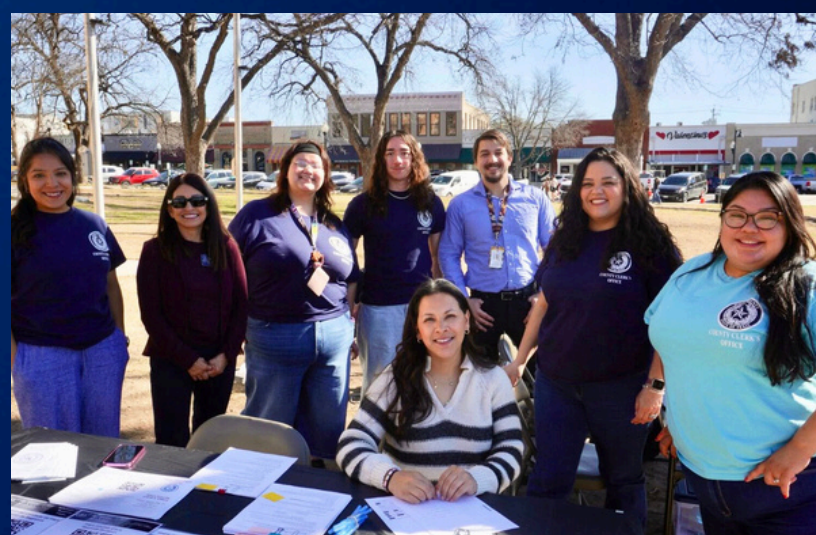
County Clerk's Office