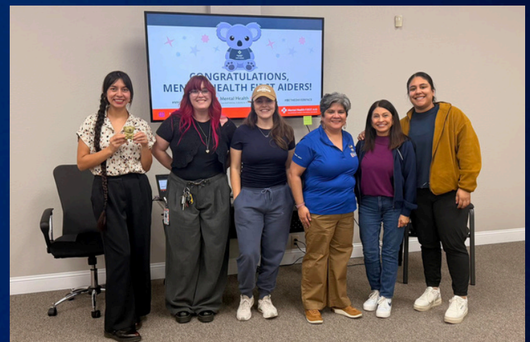
Adult Mental Health First Aid for Public Safety Training