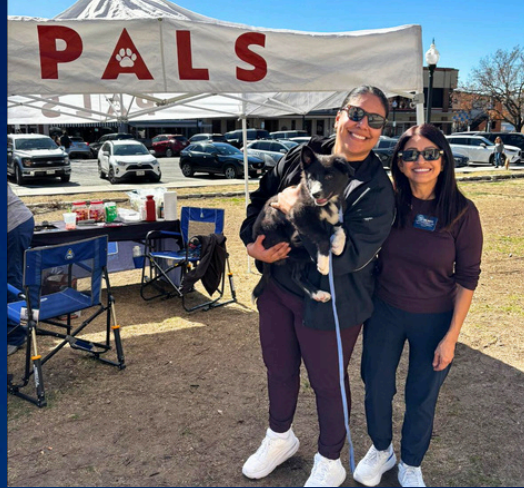
Our office with Scout from PALS!