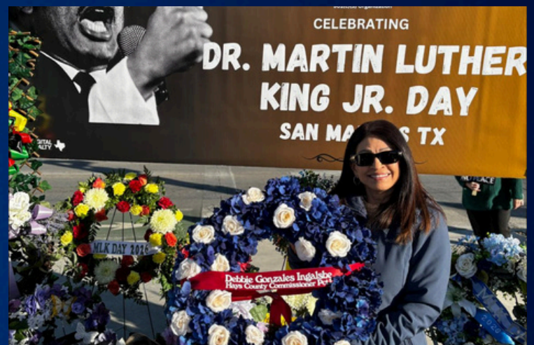
2026 MLK Celebration & March by the Dunbar Heritage Association