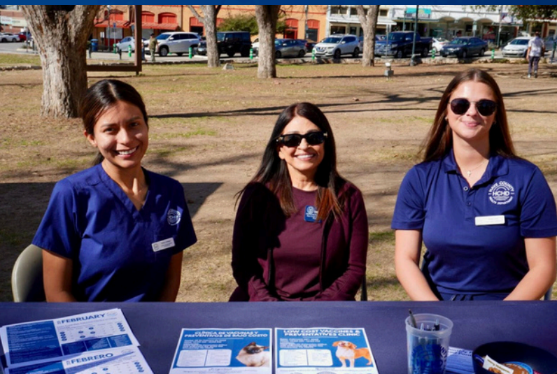
Health Department's Animal Services Division