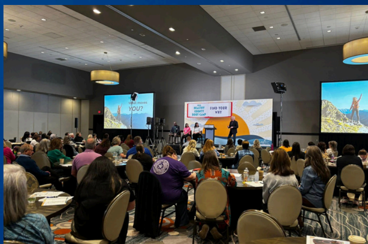
2026 Healthy County Boot Camp hosted by the Texas Association of Counties