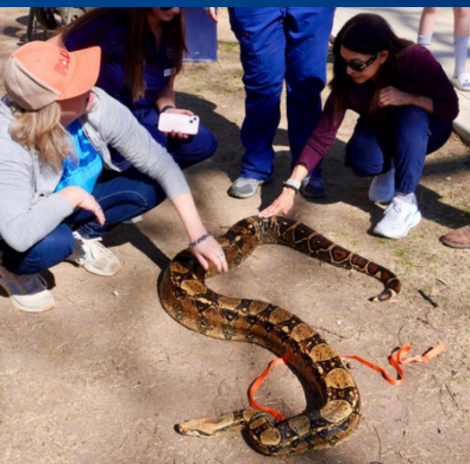
Khan the Boa Constrictor

We had a great turnout at our very first Precinct 1 Resource Event! Thank you to our county staff, our partners at Pet Prevent a Litter – PALS, and everyone in the community who stopped by. Bringing vital services together in one place is what this event was all about – and we're grateful for the teamwork and support that made it a success.