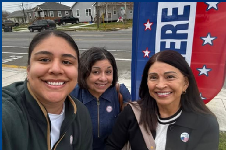
Voted early as an office!