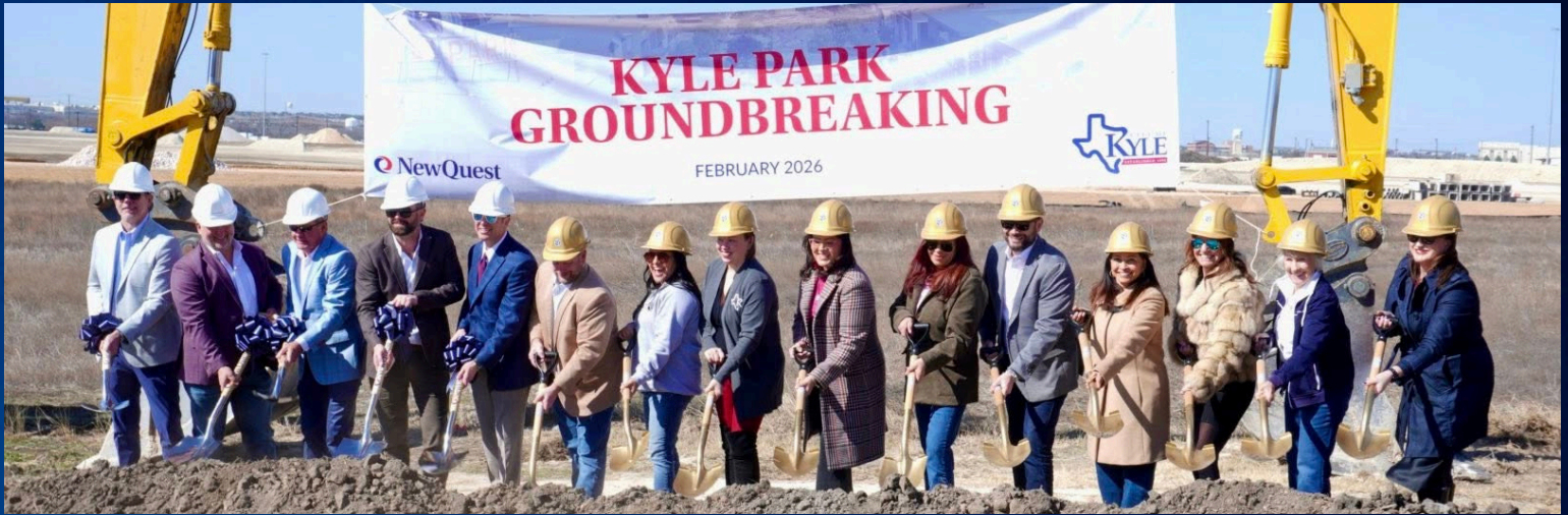
Groundbreaking of Kyle Park: Located at the North Corner of IH-35 and Bebee Rd