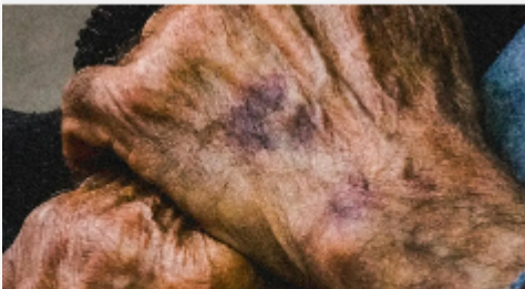
The Hidden Risks of Growing Older Without a Life & Legacy Plan