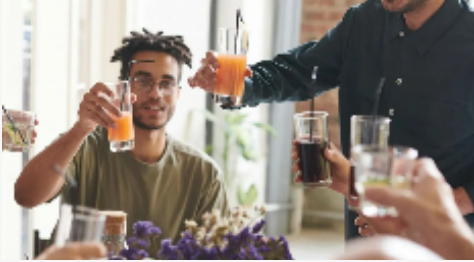
Thanksgiving Legacy: Family Stories & Future Planning