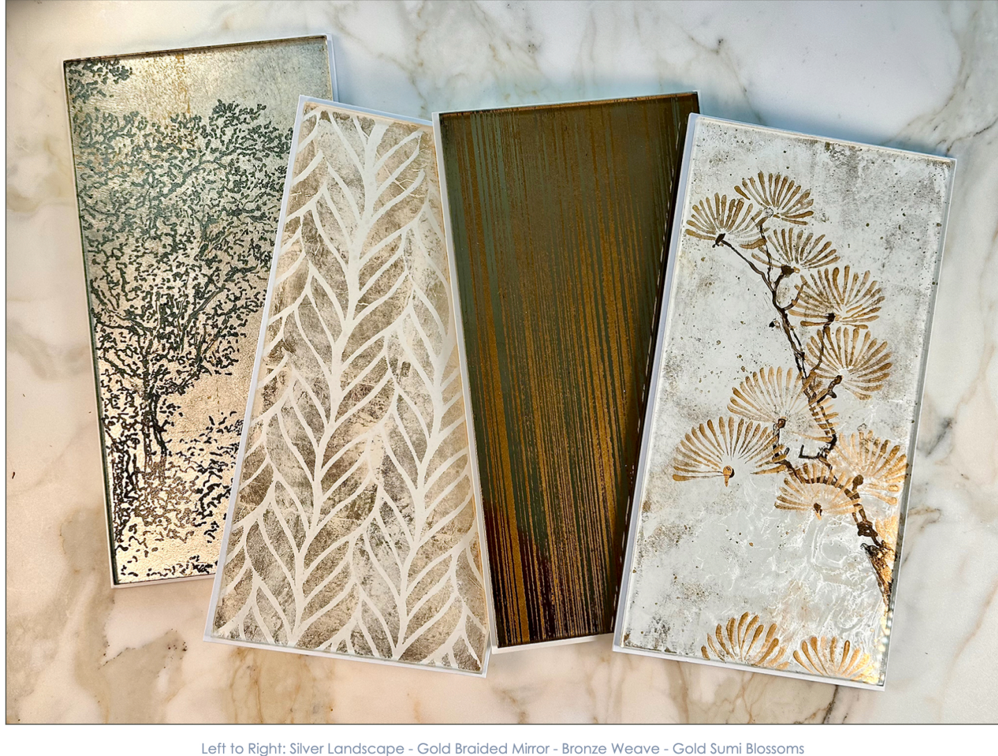
Left to Right: Silver Landscape - Gold Braided Mirror - Bronze Weave - Gold Sumi Blossoms

Some of our favorite work begins not with a client brief, but with a question we ask ourselves in the studio: what haven't we tried yet? This season, we've been deep in experimentation - pushing Eglomise into new territory with four fresh concepts that explore unexpected combinations of texture, color, pattern, and scale.