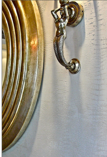
Left: Soledad Zitzewitz Interiors Center: House Beautiful Showcase House 2025 Right: de Giulio Design