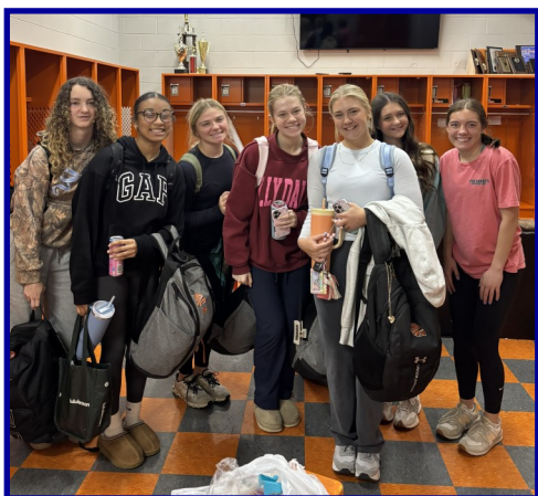
Top Left: Ripley Softball FCA devotion time!