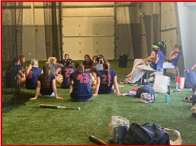
Dyersburg State Community College women's softball at team devotion.