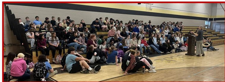
Dresden MS has approximately 130 students attending their huddle every Tuesday morning.