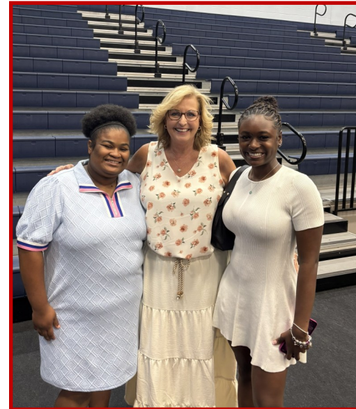
DSCC Athletic Banquet