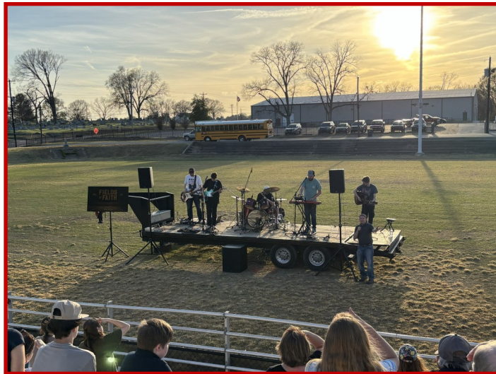
Halls HS Fields of Faith.... great music, student testimonies, an outstanding speaker plus a beautiful sunset!