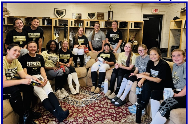
Bottom Right: Devotion and prayer before the big game with Ripley and Dyersburg.