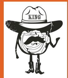
Beaver County Chamber of Commerce