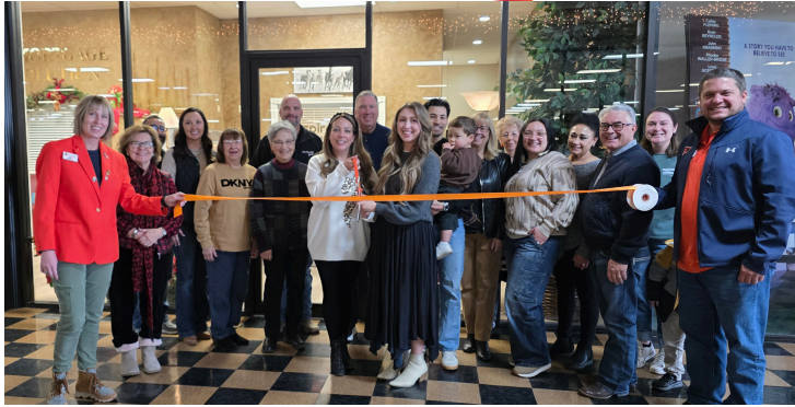
Aspire Mortgage Group