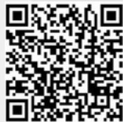
Scan to Pledge

Be part of our parish family's exciting next chapter