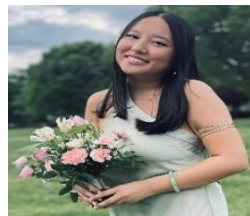
Haideen Prom 2026