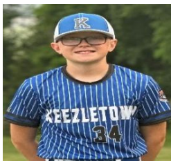
On JV Team