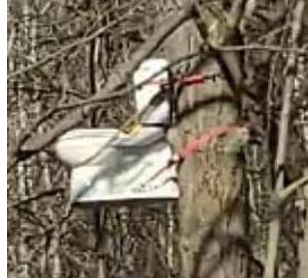
New Fall tree stand