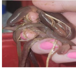
Fresh fishin' worms