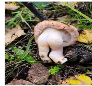
Too funny—no words