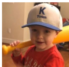
Was this yesterday? Triton's 1 st wings