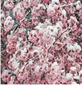
Snowy cherry tree