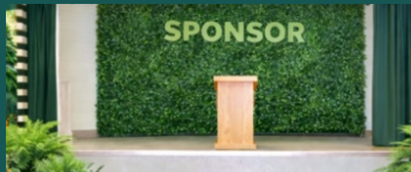
EXHIBIT HALL: HANDS-ON WORKSHOP SPONSOR