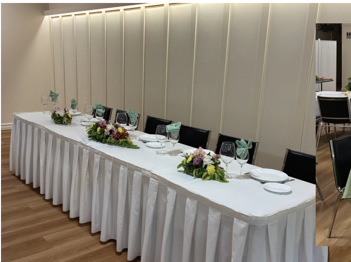
Reception Hall set up for a reception or large gathering