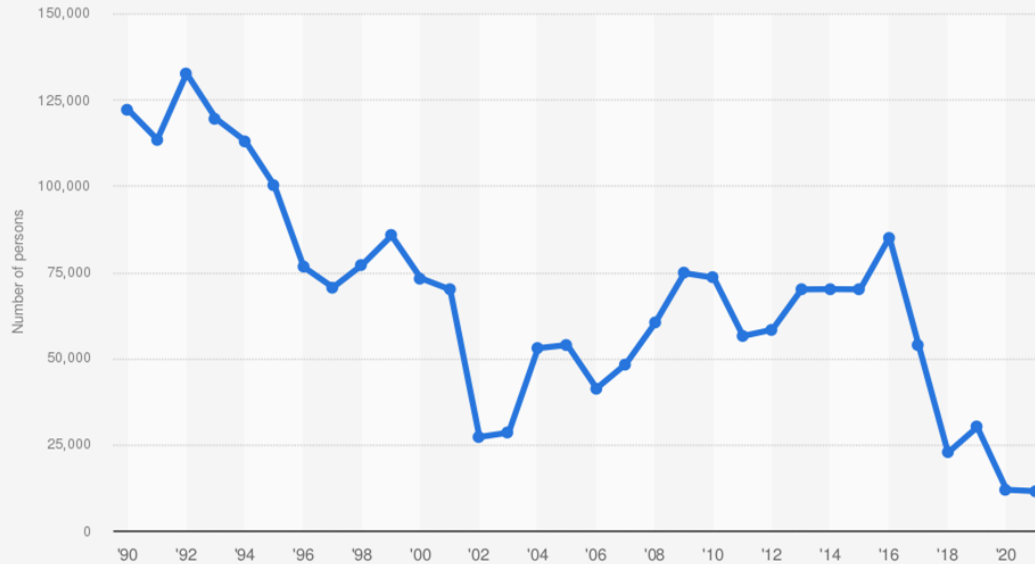
Number of refugee admissions in the U.S. from the fiscal year of 1990 to the fiscal year of 2021