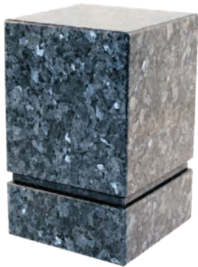
The Laprescia by Victoriaville