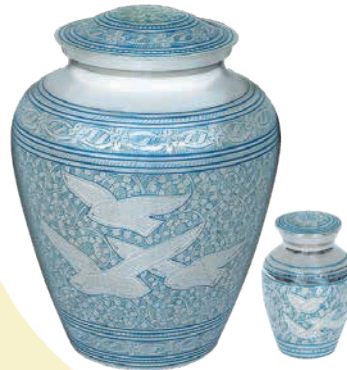
The Back Home by Victoriaville