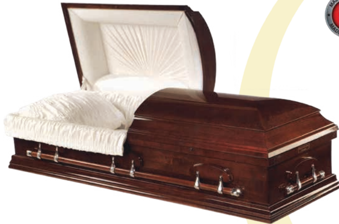
The Dominion by Victoriaville

When visiting hours and a funeral service are part of the arrangement, many families appreciate the option of a rental casket. These caskets are identical in appearance to the burial caskets, yet they function differently. Only the interior shell and bedding of the rental casket is purchased and accompanies the deceased throughout the funeral and cremation. The exterior shell of the casket serves as ornamentation and is only rented for the period of the funeral. This introduces some practical cost savings and reduces wood combustion in the cremation process.