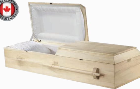
Diamond by Victoriaville

Veneer Wood (S1) Natural Finish White Crepe Interior