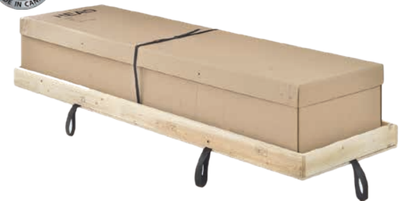
Combo Tray by Victoriaville