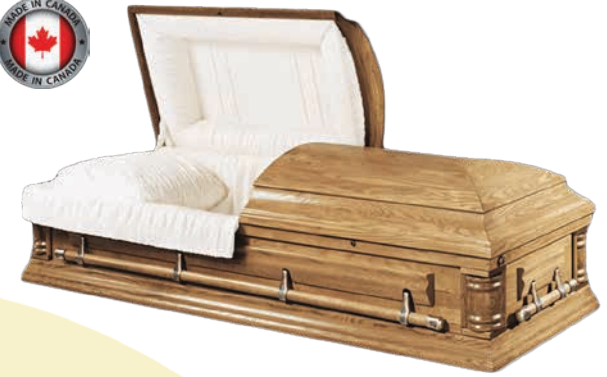
Maxima by Victoriaville

Solid Oak (S1) Fawn Satin Finish Tan Crepe Interior