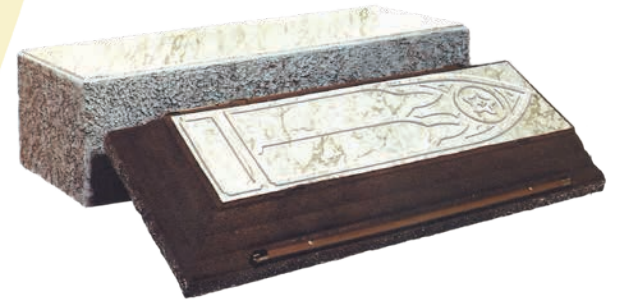
Trigard Marbleon Sealed Vault by Superior