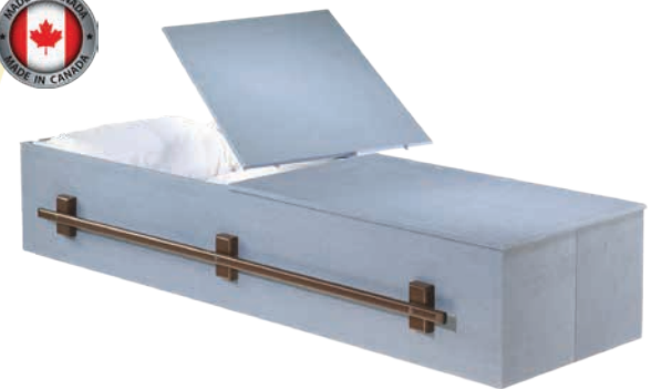
Hampton by Victoriaville

Plain Cloth Covered (VC) White Silk Interior