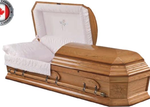
Fairholme by Victoriaville

Solid Oak (S1) Hand-Rubbed High Gloss Finish Blush Pink Crepe Interior