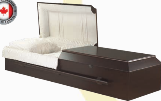
Moka by Victoriaville

Pressed Wood (VC) Panfoil Applied Finish Beige Crepe Interior