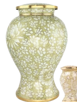
The Opal by Victoriaville