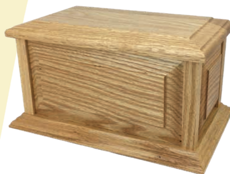
The Oakwood by Victoriaville