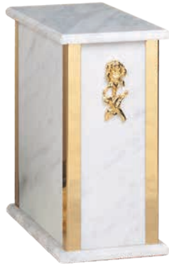
The Bianca by Victoriaville