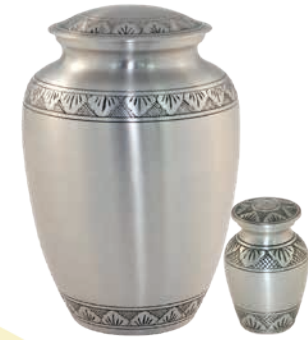
The Classic by Victoriaville