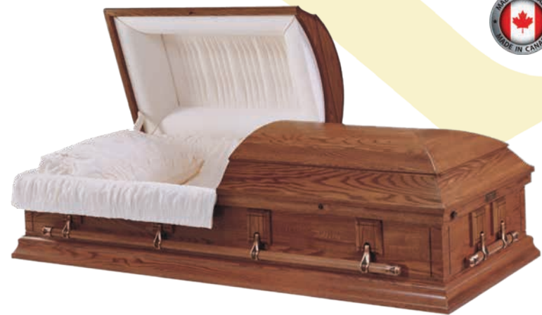
The Northgate by Victoriaville

Use of Solid Oak Ceremonial Casket 10-5756-03