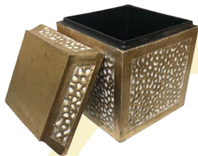
Trigard Deluxe Urn Vault by Superior