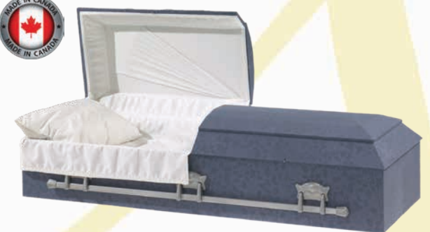
Winston by Victoriaville

Blue Figured Cloth Covered (VC) White Silk Interior