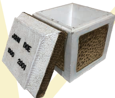
Basic Concrete Urn Vault by Superior