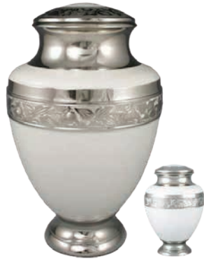
The Elegant Pearl White by Victoriaville