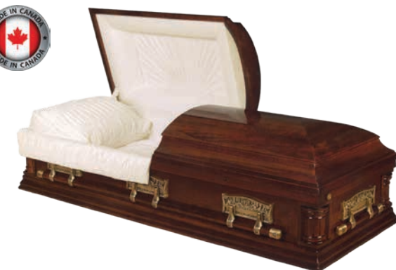
Michael Angelo by Victoriaville

Solid Maple (S1) Hand-Rubbed High Gloss Finish Last Supper Hardware Beige Velvet Interior