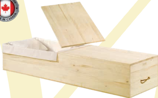
Glendale by Victoriaville

Solid Wood (S1) White Crepe Interior No Handles