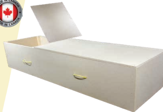
I.D.C. by N.C.P.