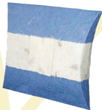
The Aqua Blue by Victoriaville