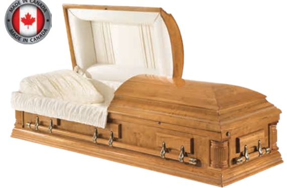
Trentfield by Victoriaville

Veneer Poplar (VS) High Gloss Finish Tan Crepe Interior