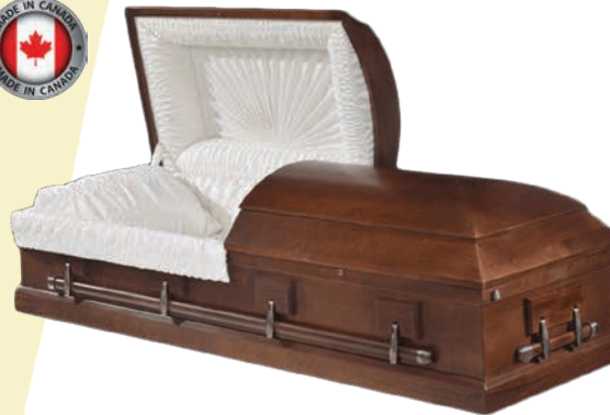
Winfield by Victoriaville

Poplar Veneer (VS) Satin Finish Tan Crepe Interior