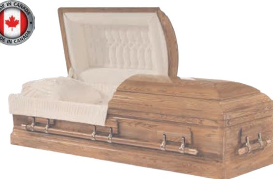
Parliament by Victoriaville

Solid Oak (S1) Hand-Rubbed High Gloss Finish Urn Side Design Beige Velvet Interior