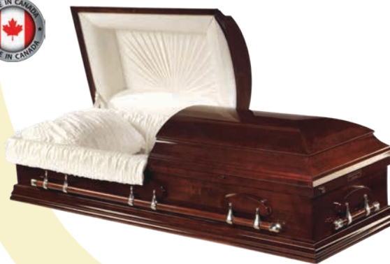
Dominion by Victoriaville

Solid Maple (S1) Hand-Rubbed High Gloss Finish Tan Crepe Interior