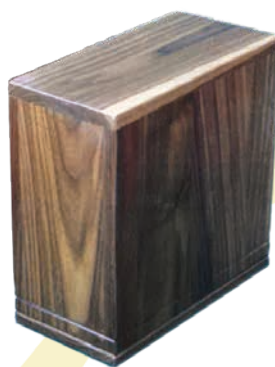
The Wallace by Wallace