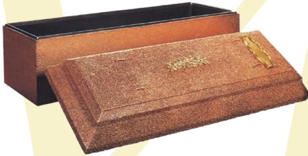
Trigard Deluxe Sealed Vault by Superior