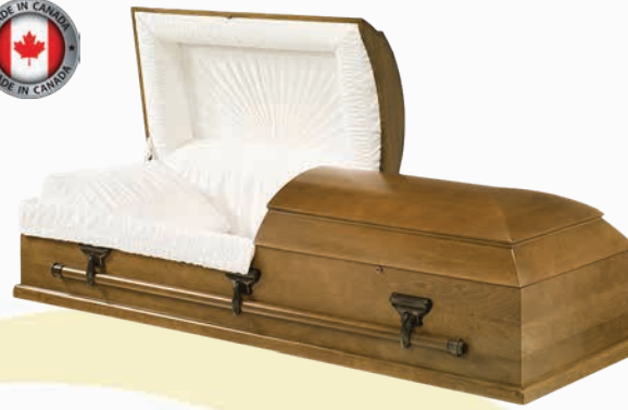
Puma by Victoriaville

Veneer Sided Hardwood (VS) Satin Finish Beige Crepe