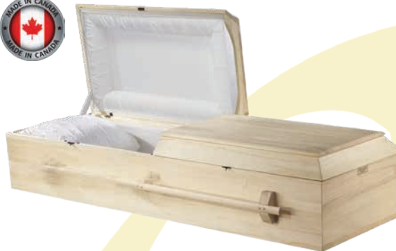
Diamond by Victoriaville

Solid Poplar (S1) Natural Finish White Crepe Interior