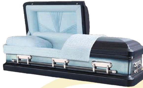
Tinley Midnight Blue by Victoriaville

18 Gauge Steel Neopolitan Blue Brushed Finish Blue Velvet Interior