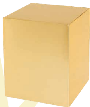
The Bronze Chest by Victoriaville

US450-00003 (FS) $695 UK450-00015 (KS) $139