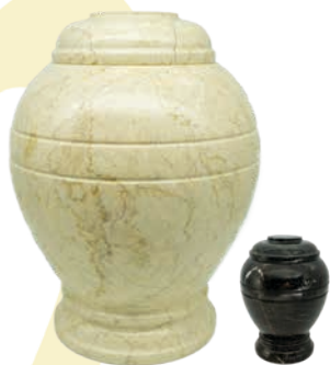
The Plinthe by Sentiments Unlimited