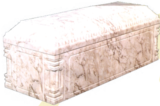
Trigard Aegean Sealed Vault by Superior