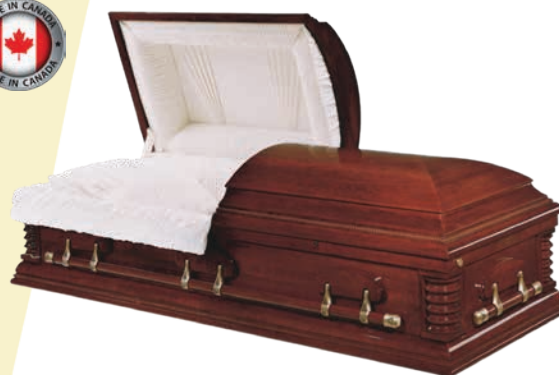
Wabash by Victoriaville

Solid Cherry (S1) Hand-Rubbed High Gloss Finish Interchangeable Keepsake Corners Beige Velvet Interior