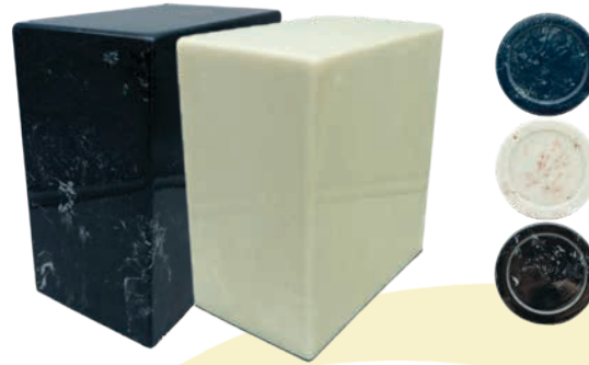
The Vision by Fabhaven