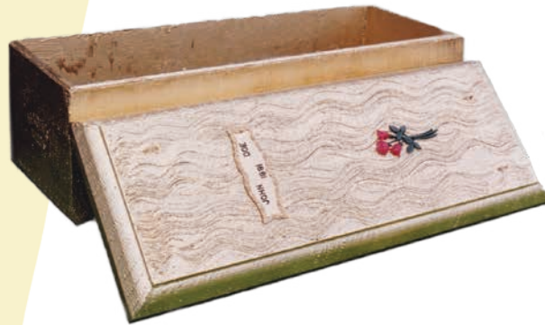
Basic Sealed Vault by Superior