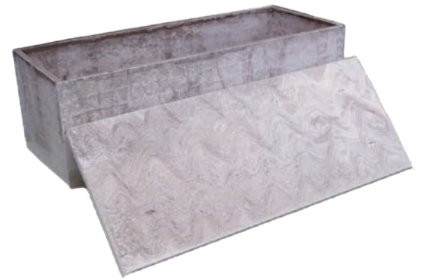
Basic Unsealed Grave Liner by Superior