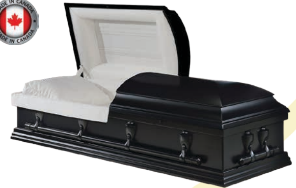
Carnaby by Victoriaville

Solid Poplar (S1) Beige Basket Weave Interior Vanta Black Satin Finish