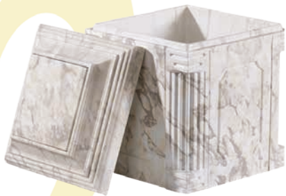
Trigard Aegean Urn Vault by Superior