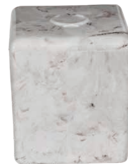
Marbleon Urn Vault by Fabhaven