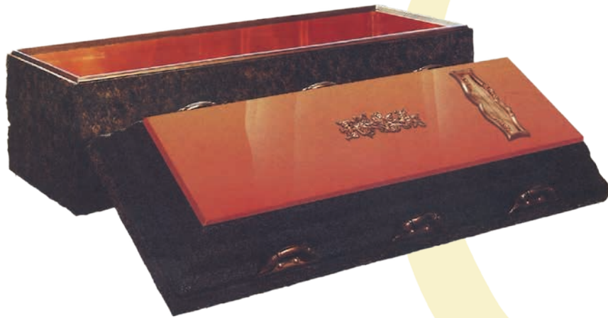
Trigard Deluxe Sealed Vault by Superior