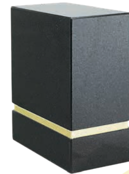
The Noble by Victoriaville