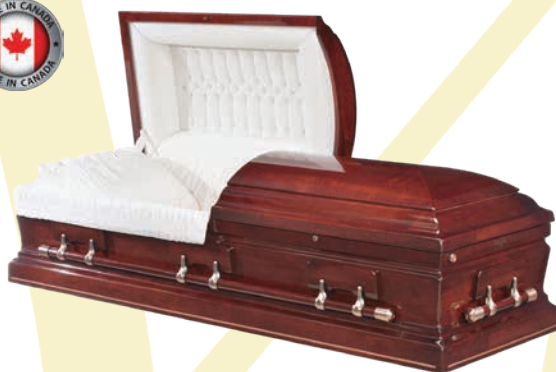
Cabernet by Victoriaville

Solid Maple (S1) Hand-Rubbed High Gloss Finish Urn Side Design Beige Velvet Interior