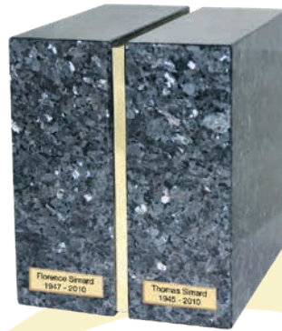
The Unica Companion by Victoriaville

Companion Urn Solid Granite 2 Openings with Divider