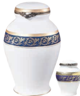
The Limoges by Victoriaville