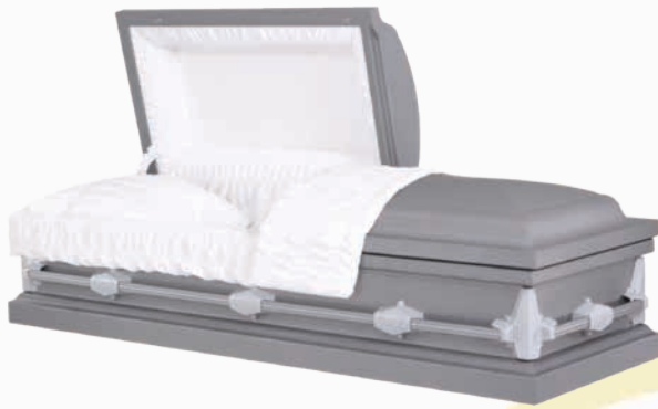
Coleman by Victoriaville

20 Gauge Steel Light Gunmetal Finish White Crepe Interior