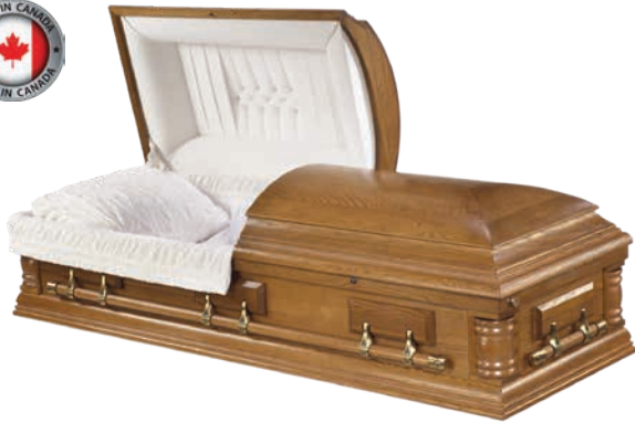
Woodstock by Victoriaville

Solid Oak (S1) Topaz Satin Finish Beige Velvet Interior