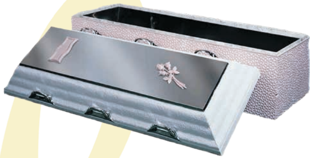
Trigard Deluxe Caroline Sealed Vault by Superior