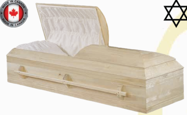
Tilton by Victoriaville

All Wood Construction (SI) Green Burial Compliant Natural Finish