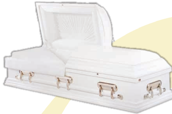
Heavenly White by Victoriaville

Veneer Poplar (VS) White High Gloss Finish White Crepe Interior