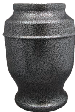
The Thamesford by Gravure Craft