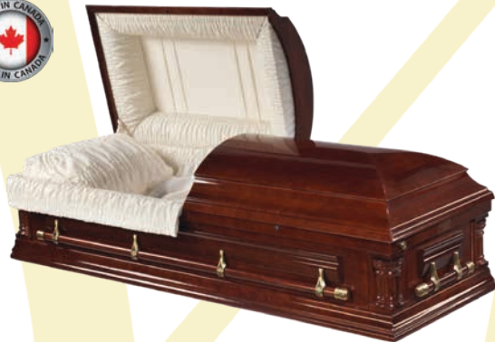
Homeward by Victoriaville

Veneer Poplar (VS) High Gloss Finish Tan Crepe Interior