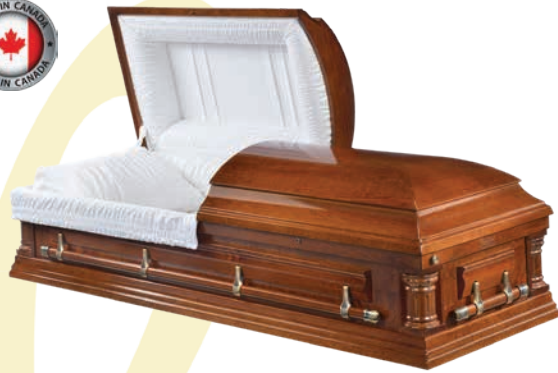
Brennan by Victoriaville

Solid and Wood Veneer (VS) Polished Finish White Velvet Interior