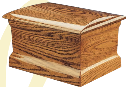
The Colonial by Victoriaville