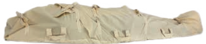
Green Burial Shrouds are 100% biodegradable