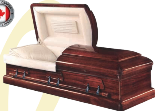
St. George by Victoriaville

Solid Mahogany (S1) Titian Hand-Rubbed High Gloss Finish Custom Crafted for our Funeral Home Silver Beige Interior