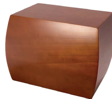
The Brenton by Victoriaville