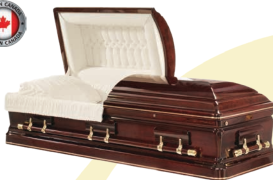
Bordeaux by Victoriaville

Solid Cherry (S1) Hand-Rubbed High Gloss Finish Urn Side Design Beige Velvet Interior