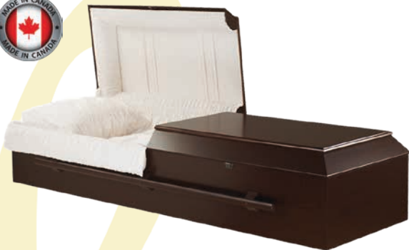
Moka by Victoriaville

Pressed Wood (VC) Panfoil Applied Finish Beige Crepe Interior