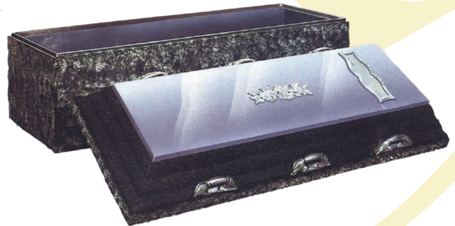
Trigard Deluxe Sealed Vault by Superior