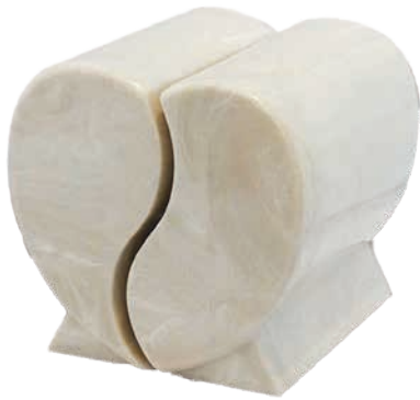
The Heart Ivory Companion by Victoriaville