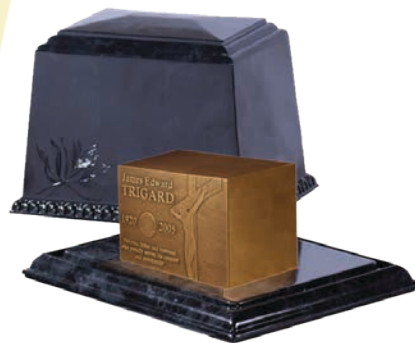
Trigard Millennium Urn Vault by Superior