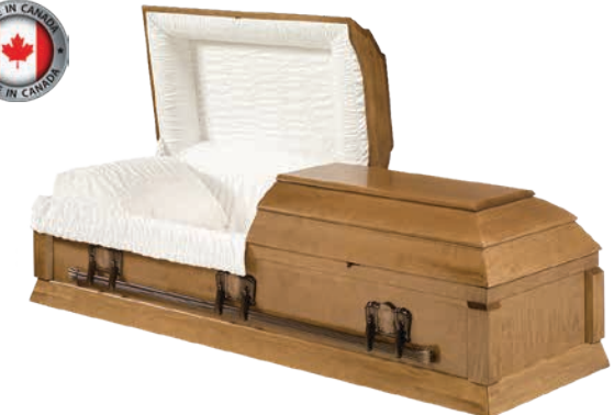
Dover by Victoriaville

Poplar Veneer (VS) Satin Finish White Silk Interior