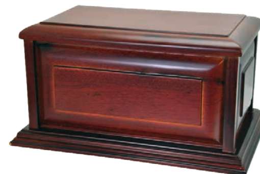
The Federal by Commemorate