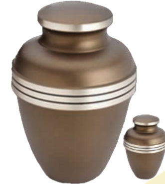
The Saturn Chestnut by Commemorate