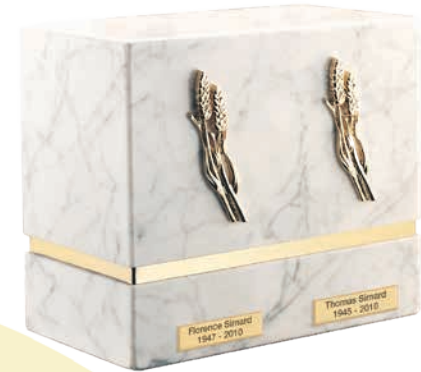
The Nova Companion by Victoriaville

Companion Urn Solid Marble 2 Openings with Divider