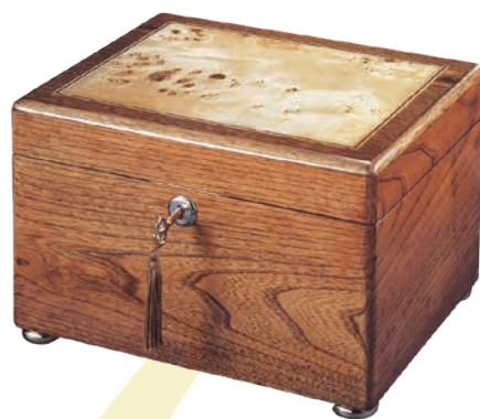
The Windsor by Victoriaville