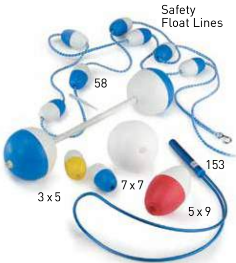
Safety Float Lines