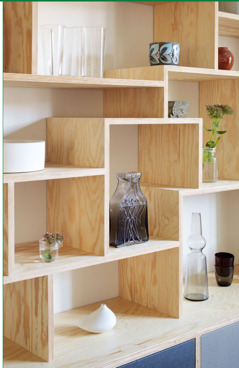
Thin & attractive layers