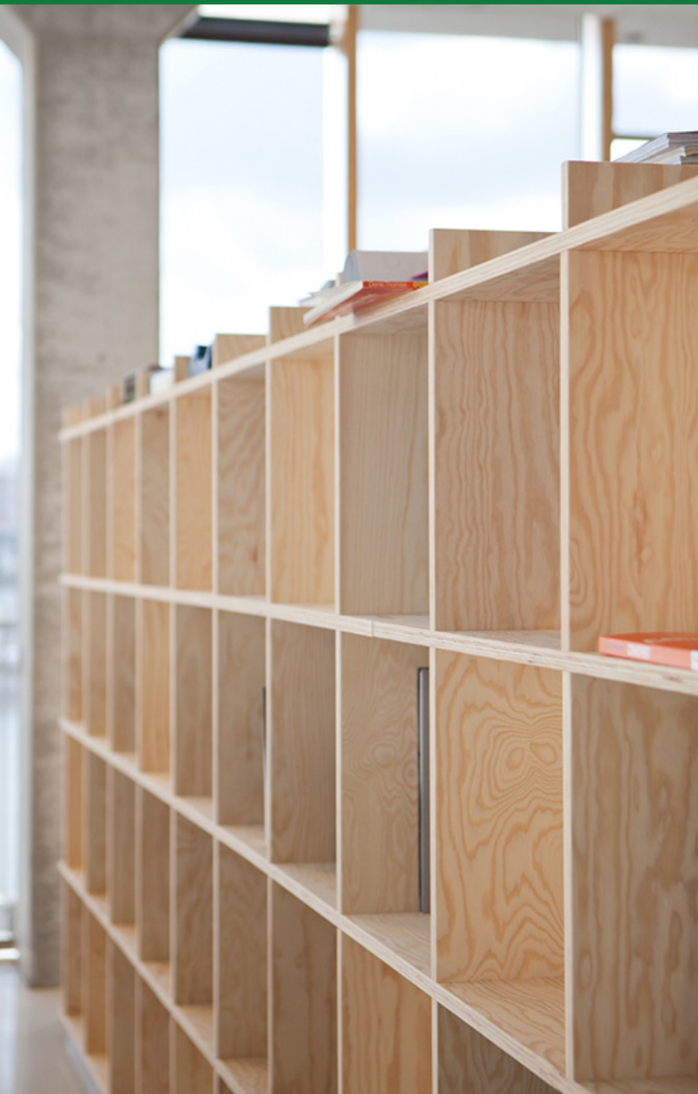
Solid & consistent cores