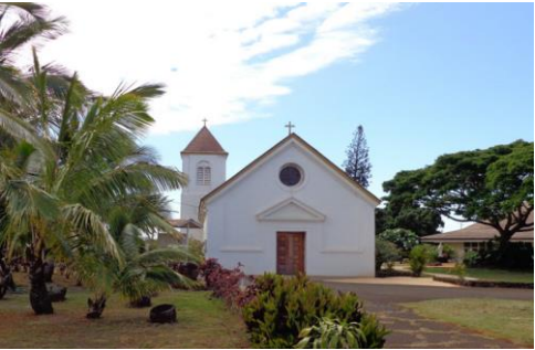
OLD HISTORICAL CHURCH

May the message of Our Lady of La Salette lead us to conversion and reconciling way of life . Let us heed her call to “make her message known to all people.”