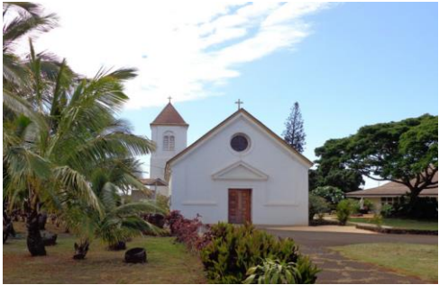
OLD HISTORICAL CHURCH