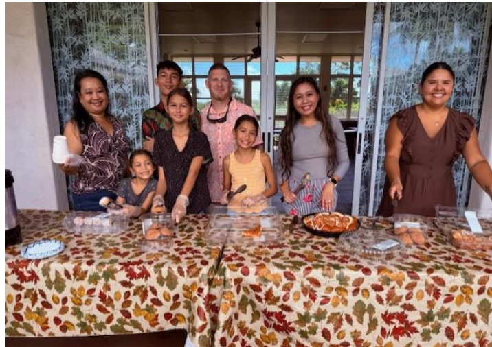
Volunteers for Hospitality following 9:30 am Mass November 16th