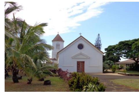
OLD HISTORICAL CHURCH